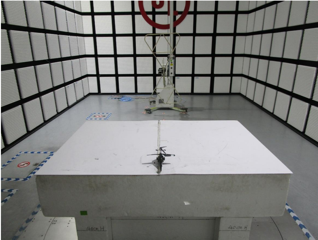
Radiated Disturbance below 30 MHz