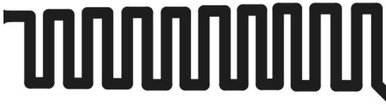
Length 20mm and Width 5mm