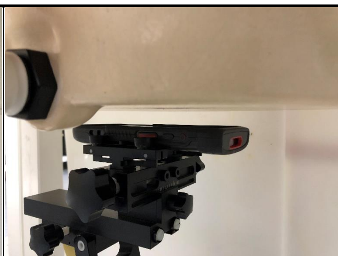
Front Face of EUT with 1.5 cm Gap