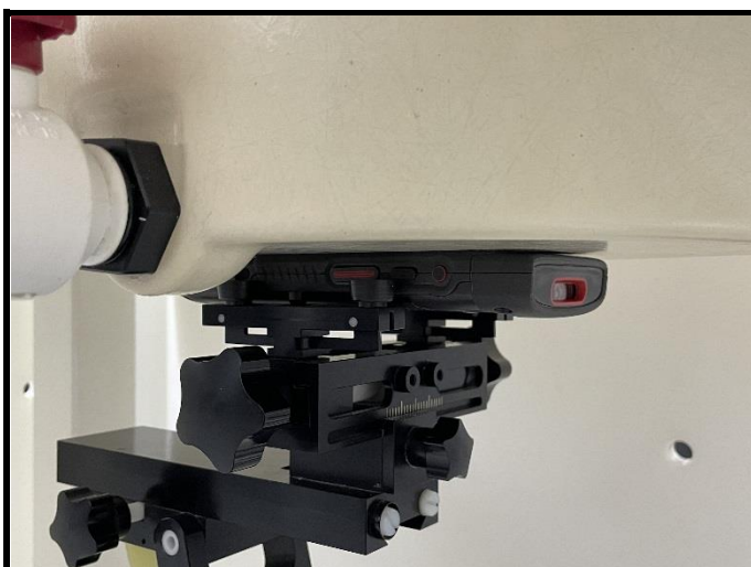
Front Face of EUT with 0 cm Gap