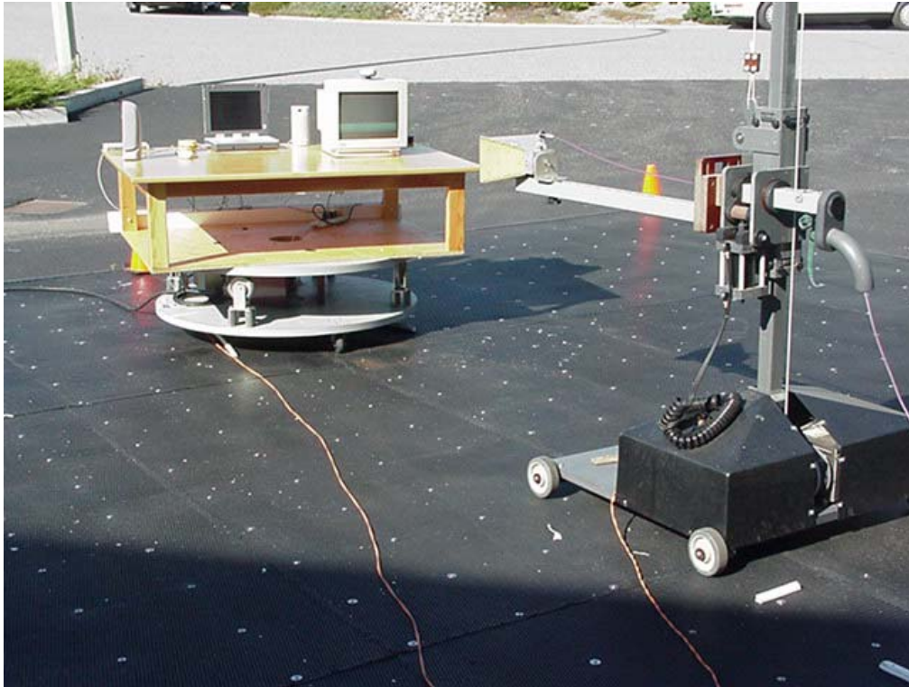
Photograph D-1 - 3115 Horn Antenna