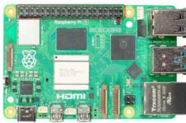
Figure 3 - 40 Pin GPIO Header J8

The module integrator may choose to power the Raspberry Pi 5 via the 40 Pin General Purpose Input Output (GPIO) header (J8).