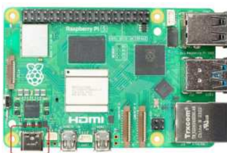
Figure 2 - USB-C Power Connector J1

Warning: it is the responsibility of the module integrator to select a suitable PSU. This is to be connected via the J1 connector: