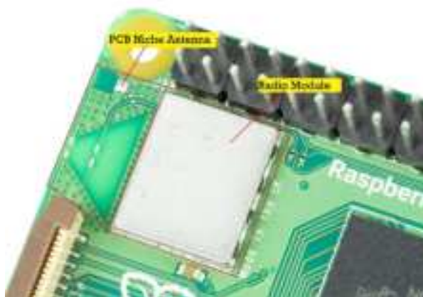
Figure 1 - Radio Circuitry

When locating the Raspberry Pi 5 within a product, a separation distance greater than 20cm must always be maintained between the antenna and any other radio transmitter if installed in the same product. The module is physically attached and held in place by screws.