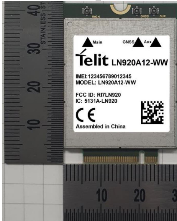
Back View of EUT_LN920A12-WW