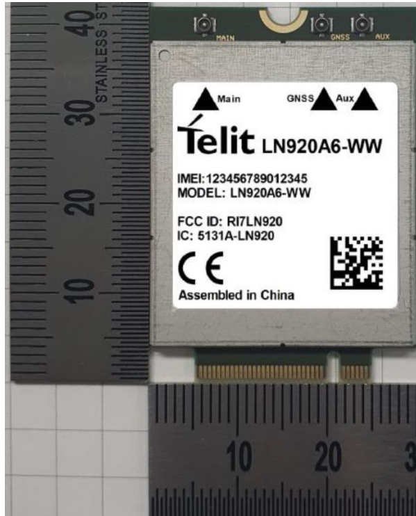
Back View of EUT_ LN920A6-WW