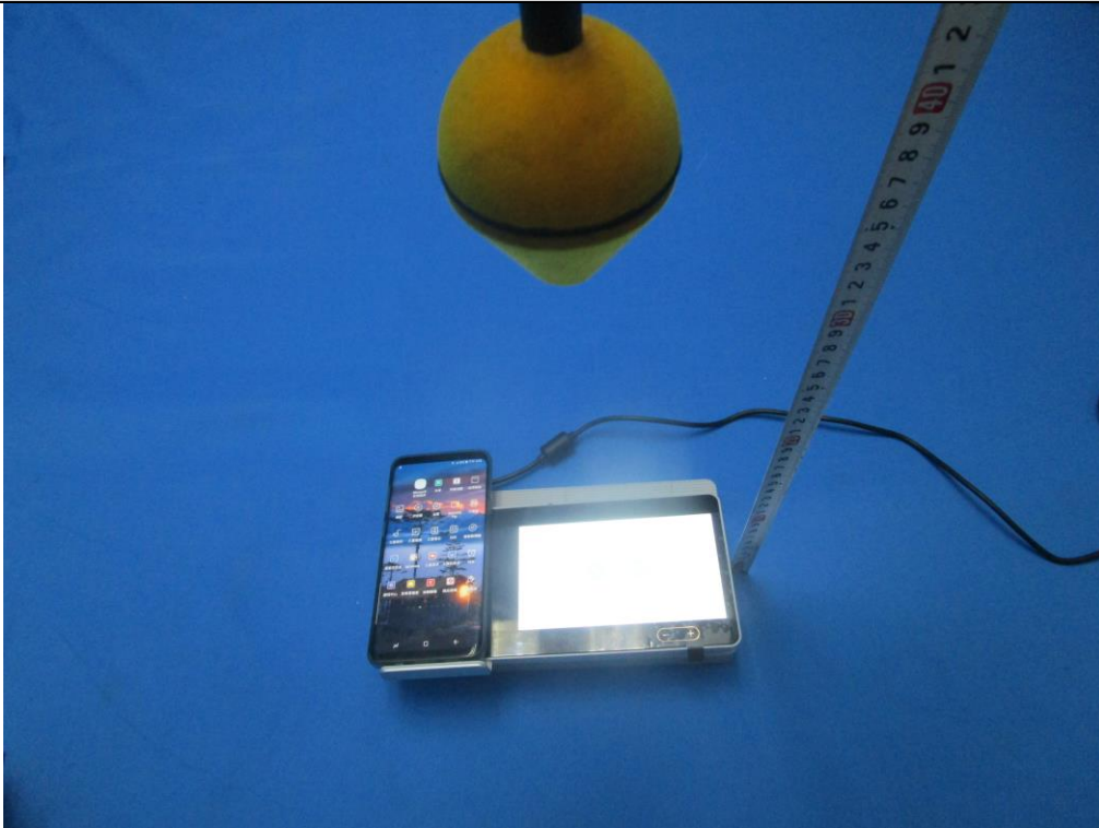
Back Side(15 cm)