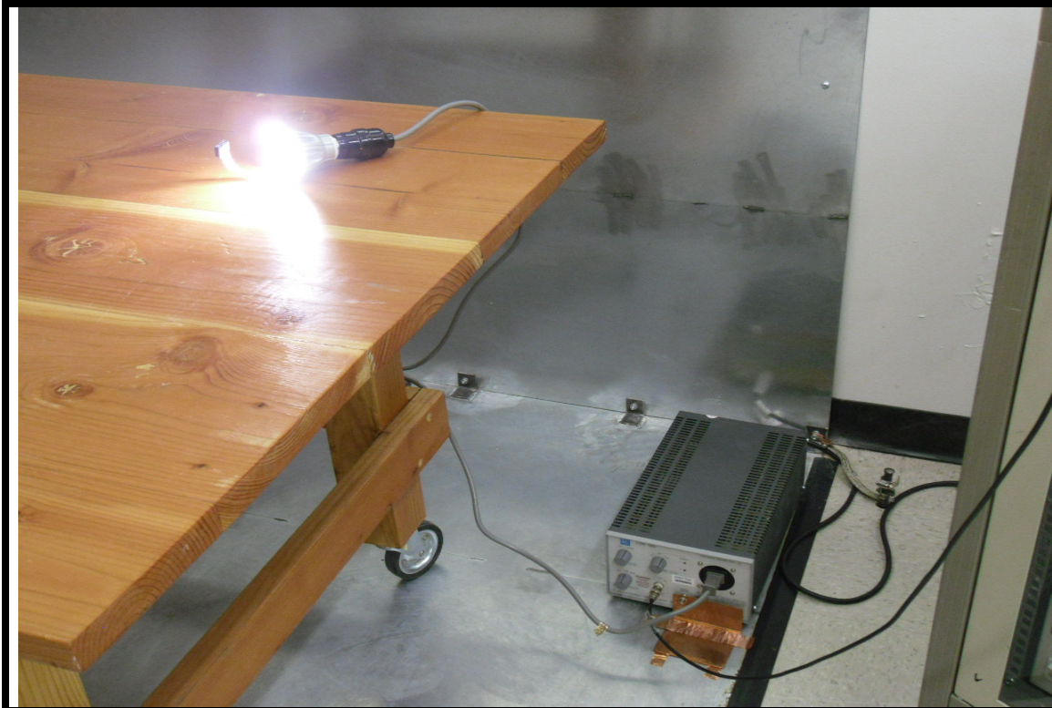
Test Setup Photo 3 – Conducted Emissions