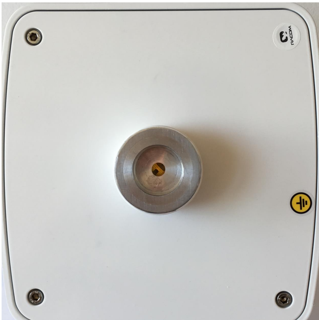
Side 2 of 6, Detail of Waveguide Port