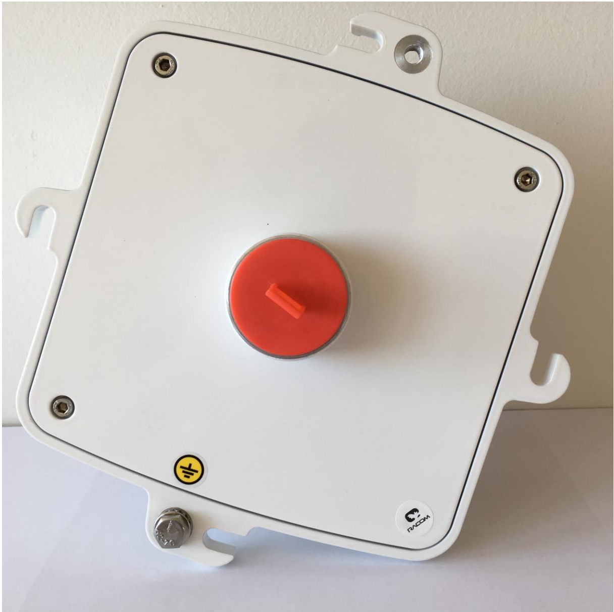
Side 2 of 6