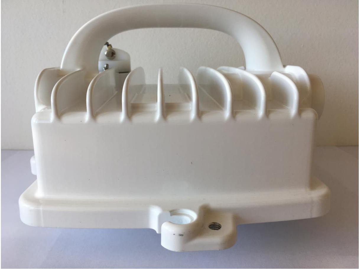
Side 4 of 6