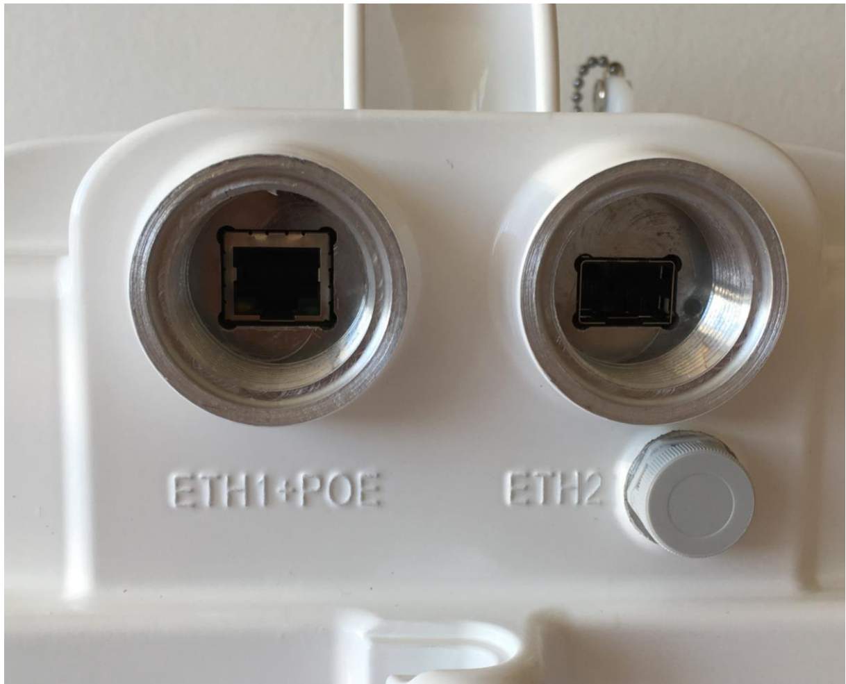
Side 5 of 6, Detail of ports