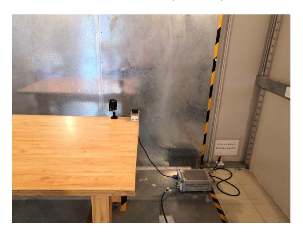
Conducted Emissions (Side View)