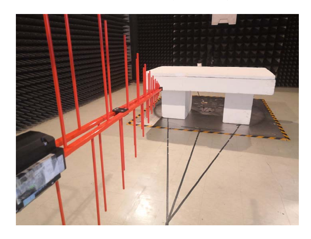
Radiated Emissions (Above 1GHz)