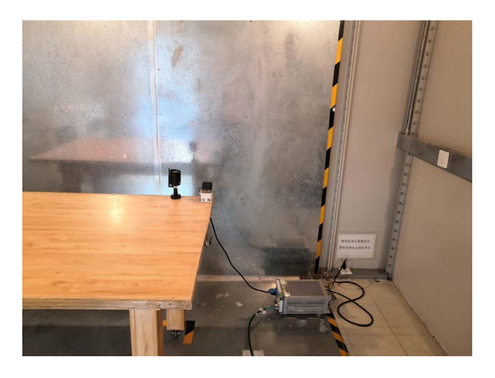
Conducted Emissions (Side View)