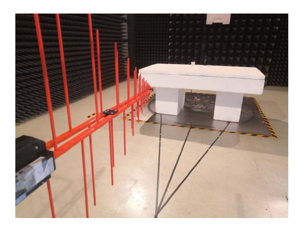
Radiated Emissions (Above 1GHz)