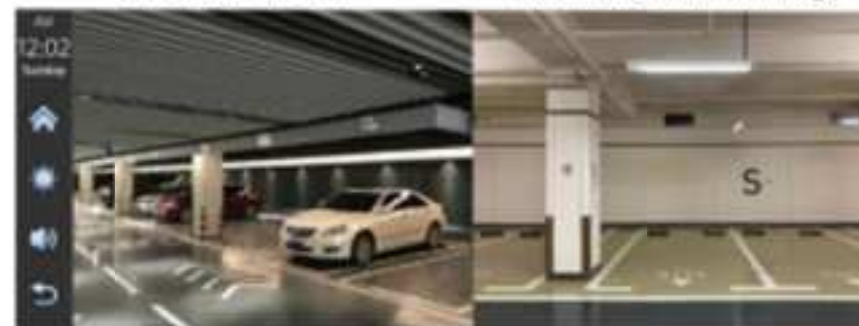
Reversing camera image