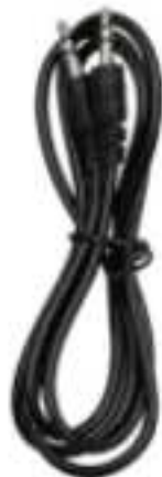
AUX audio cable