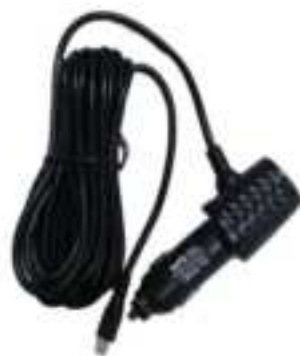
Car charger INPUT: DC12~24V OUTPUT: 5V/3.1A

This device is powered by 5V USB, After the device is installed, insert the USB plug into the cigarette lighter car charger to start it up and use it.