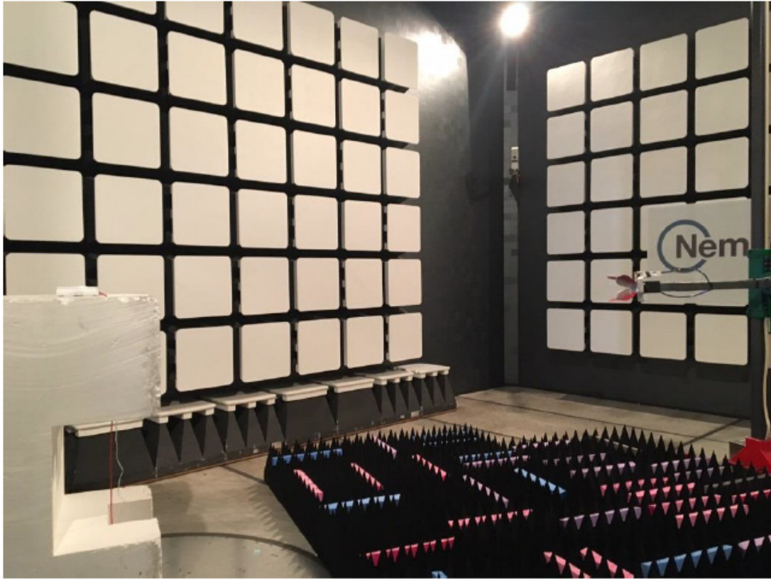
Figure 8.1-17: Radiated – Undesirable (unwanted) emissions setup photo – above 1 GHz