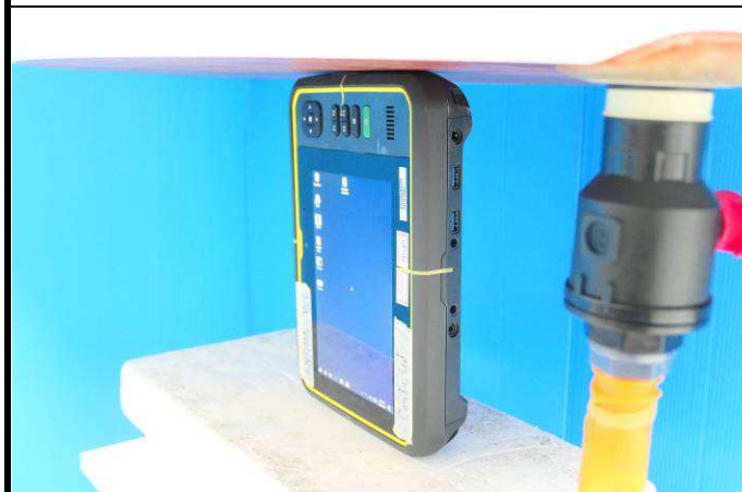
Right Side of EUT Tested at 0 mm