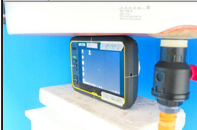
Bottom Side of EUT Tested at 0 mm