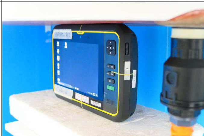
Top Side of EUT Tested at 0 mm