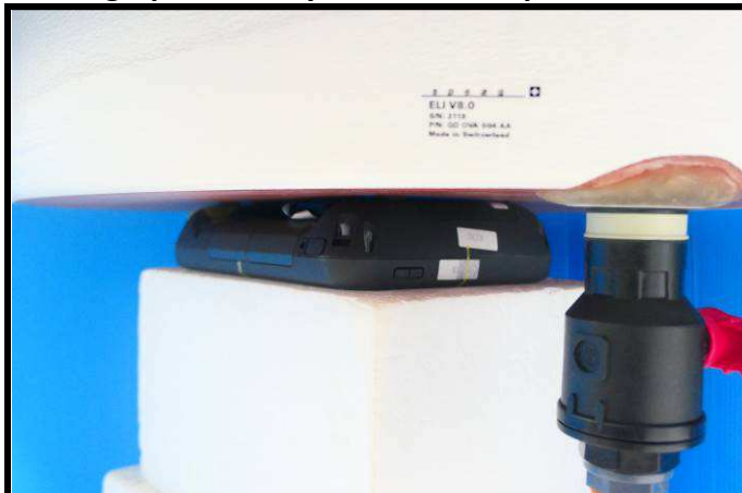
Rear Face of EUT Tested at 0 mm