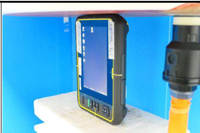
Left Side of EUT Tested at 0 mm