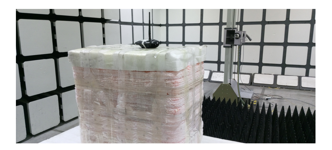
Radiated Emissions View (18-25 GHz)