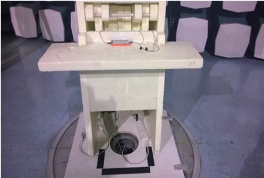
Picture 2. FCC Part 15B Radiated emissions