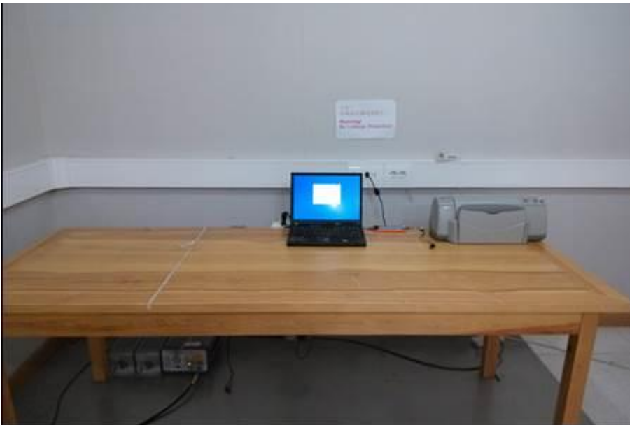
Picture 5. FCC Part 15B AC powerline conducted emissions, computer peripherals, measure from PC charger