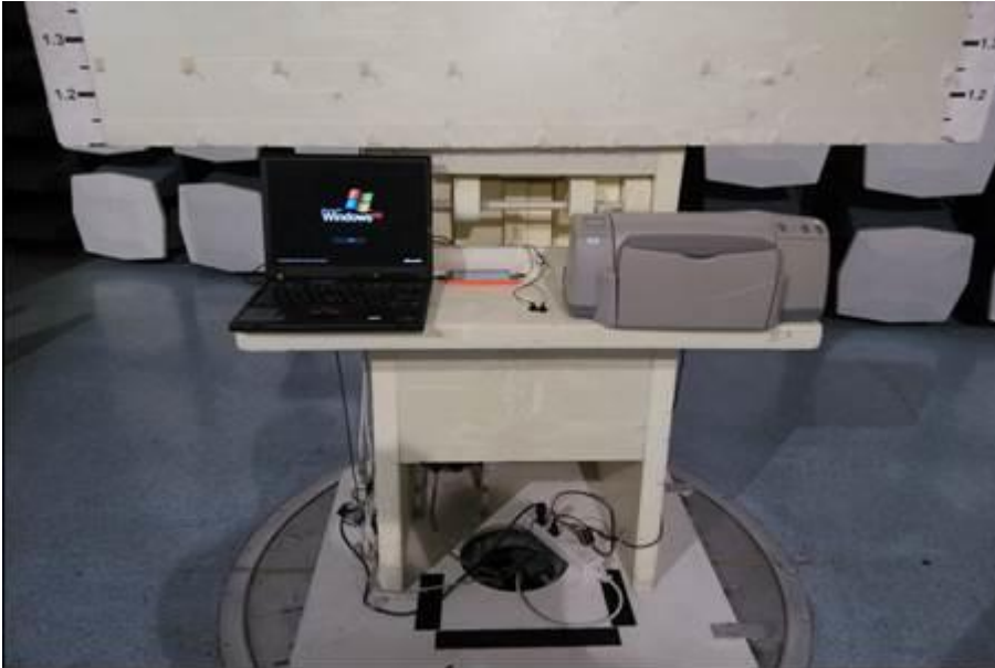
Picture 3. FCC Part 15B Radiated emissions, computer peripherals