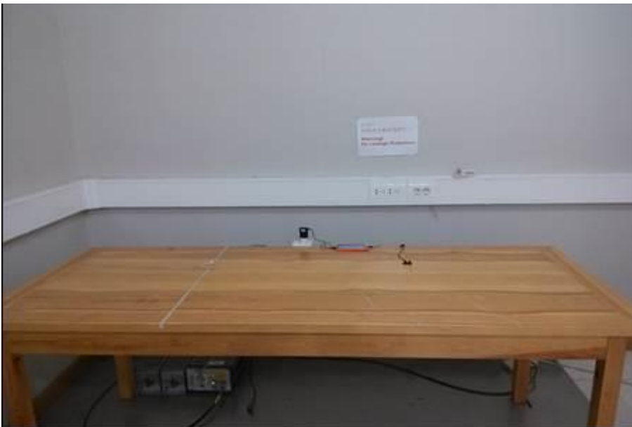
Picture 4. FCC Part 15C AC powerline conducted emissions