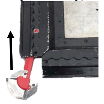
Slide Sentinel 100P tag into extrusion rail on pallet.