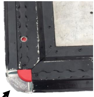
Slide Sentinel 100P and corner piece info pallet extrusion rail until corner piece is flush.