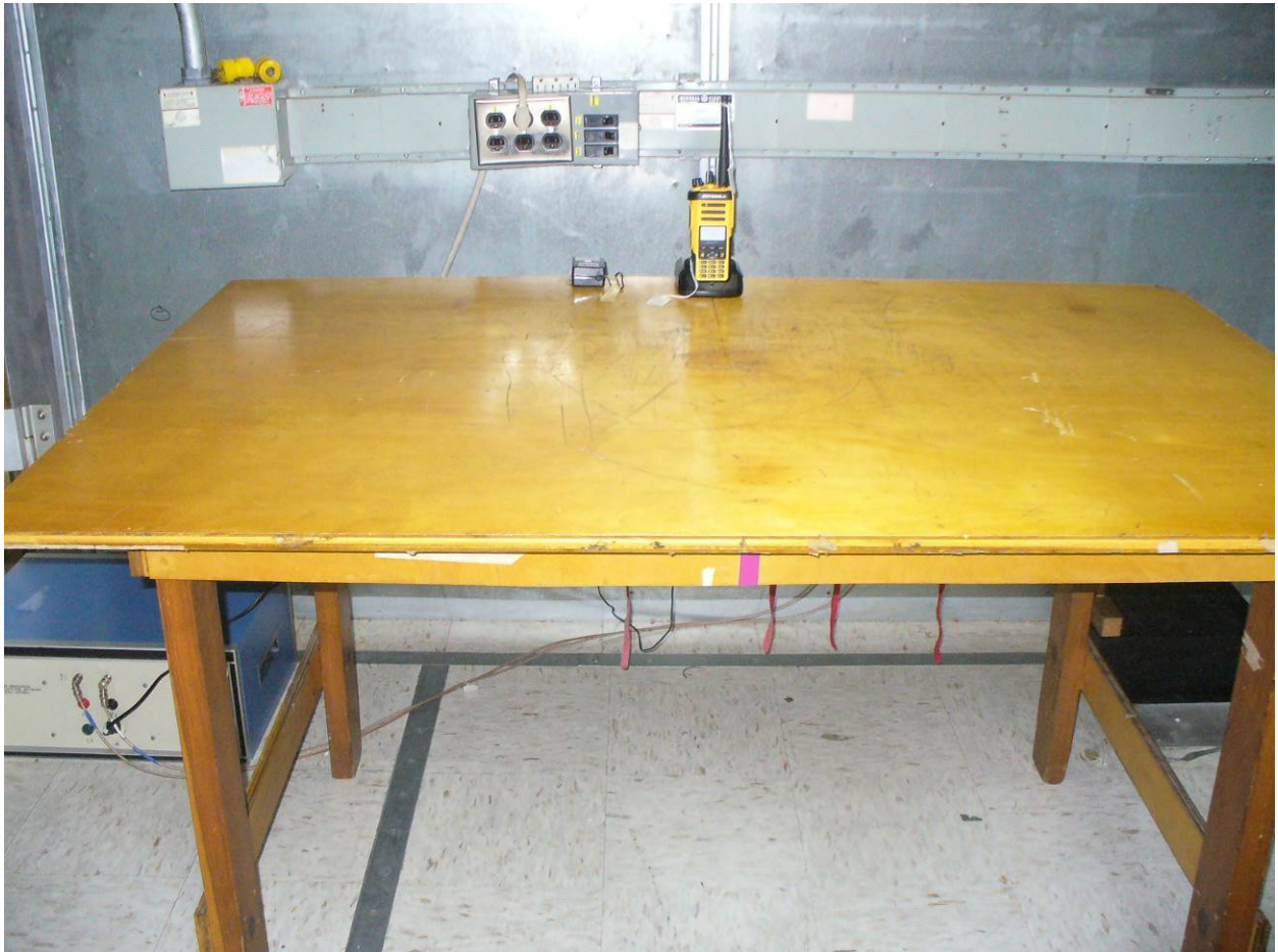
Figure 8: Power Line Conducted Emissions – Front View