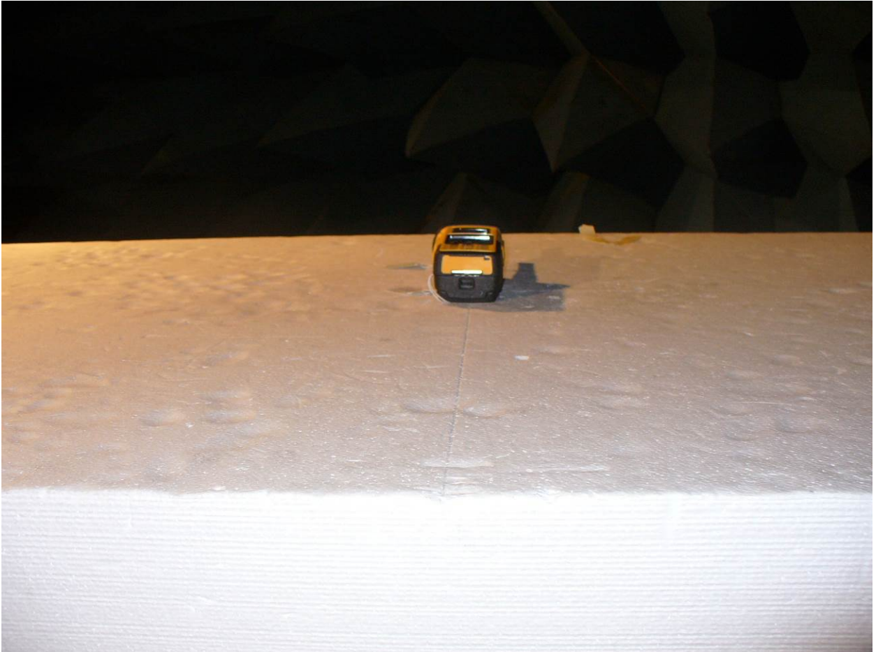
Figure 5: Radiated Emissions – Front View – EUT Flat