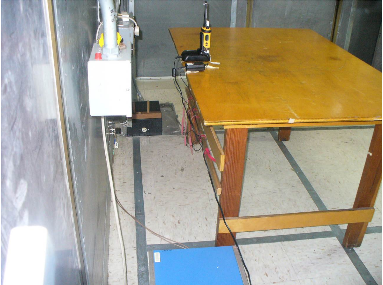
Figure 9: Power Line Conducted Emissions – Side View