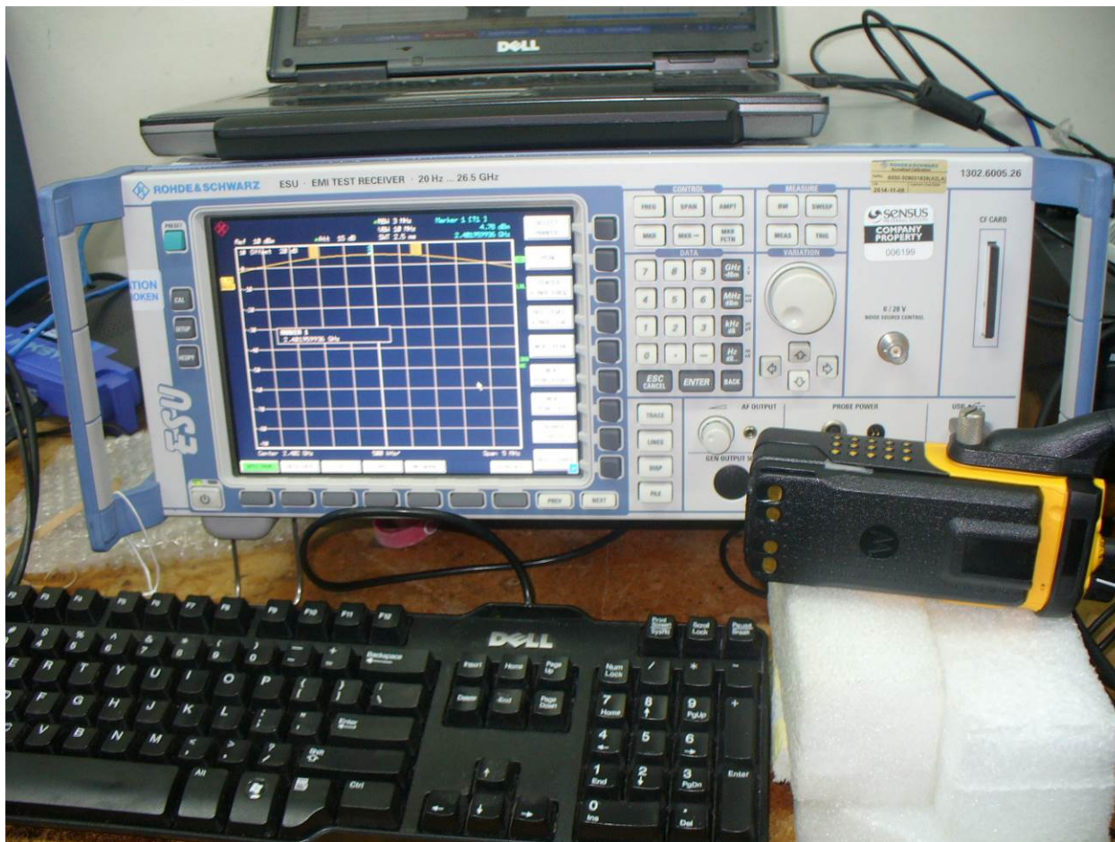
Figure 7: RF Conducted Emissions