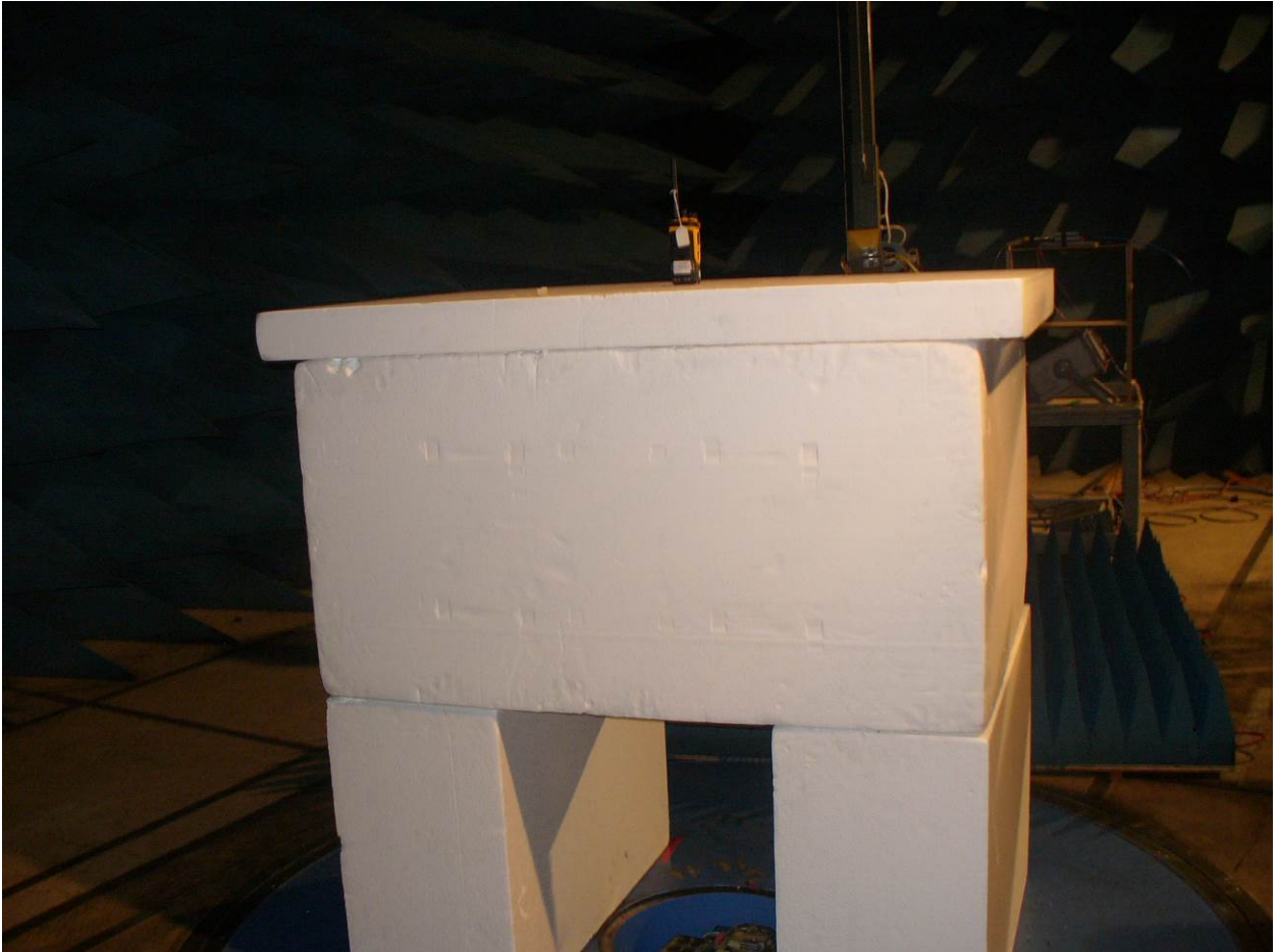
Figure 2: Radiated Emissions – Back View – EUT Standing