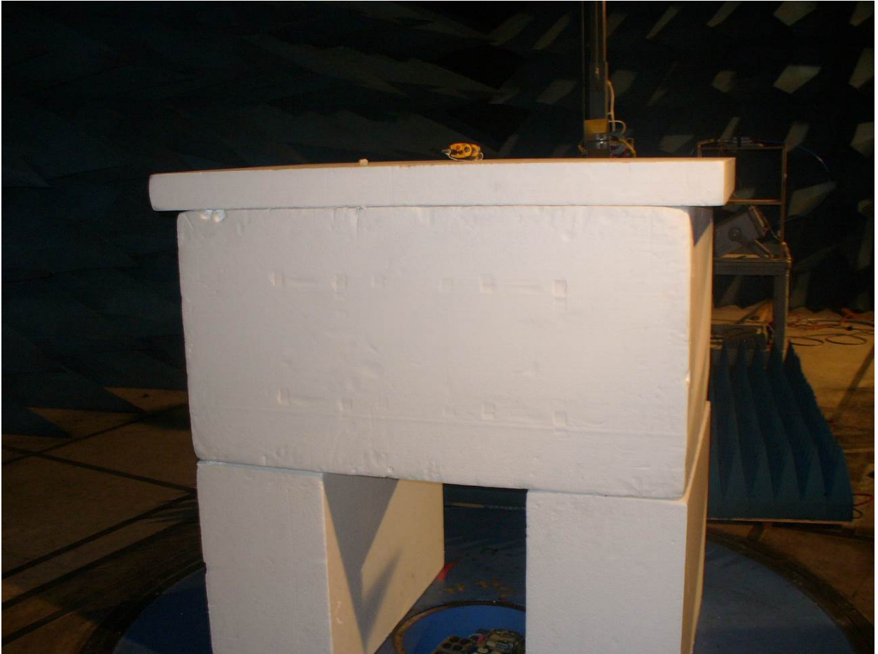
Figure 6: Radiated Emissions – Back View – EUT Flat