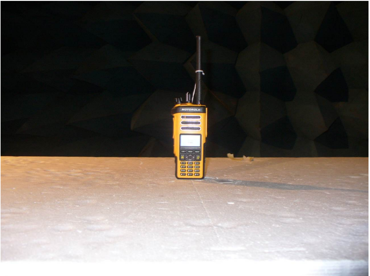
Figure 1: Radiated Emissions – Front View – EUT Standing