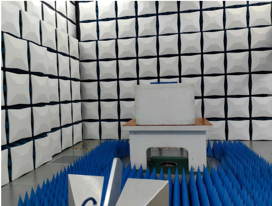
Test Set-up: Radiated spurious emission 1GHz-5GHz