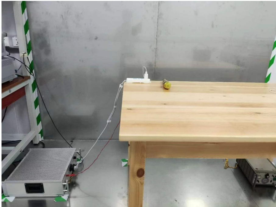
Radiated Spurious Emission (below 1GHz)