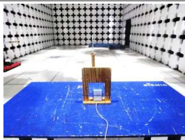
Radiated Emissions (<30MHz) – Rear View 0 degree