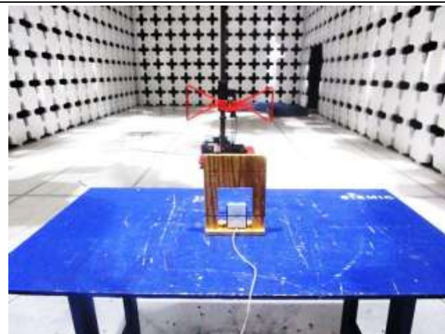
Radiated Emissions (<1GHz) – Rear View