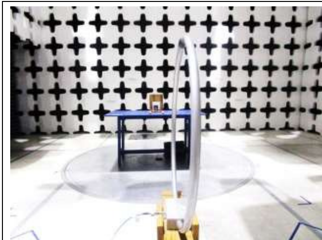
Radiated Emissions (<30MHz) – Front View 0 degree