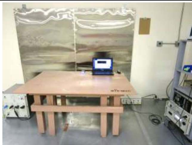
AC Line Conducted Emissions– Front View