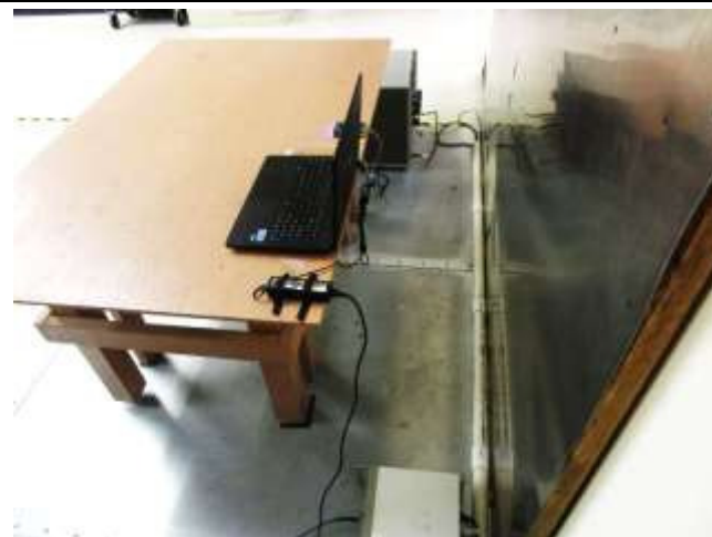
AC Line Conducted Emissions– Rear View