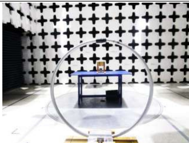
Radiated Emissions (<30MHz) – Front View 0 degree