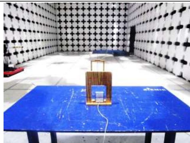
Radiated Emissions (<30MHz) – Rear View 0 degree