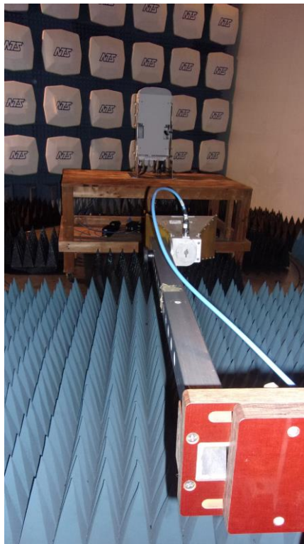
Radiated Spurious Emissions – 1-10GHz