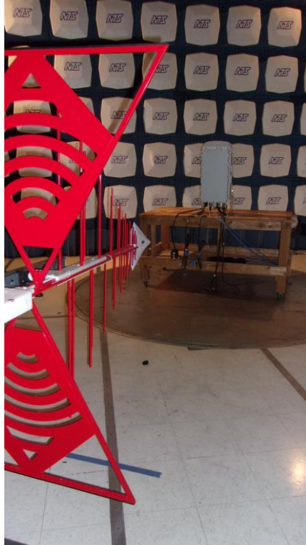
Radiated Spurious Emissions – 30-1000MHz