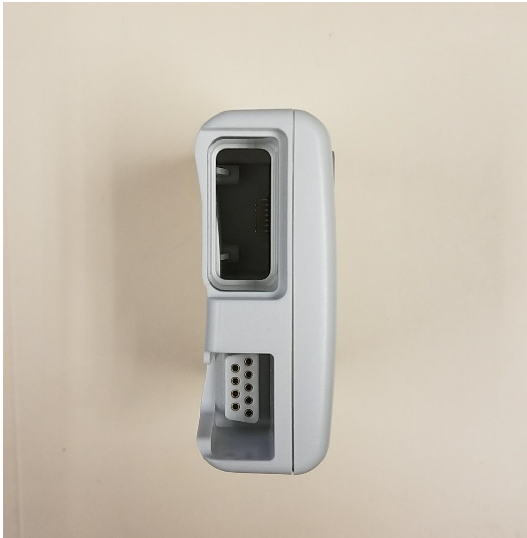
Host Device – Top Side

FCC Part 15/ISED Certification 07P-341 0147A-341 17-0338 March 30, 2018 Inventek ISM43340-M4G-L44