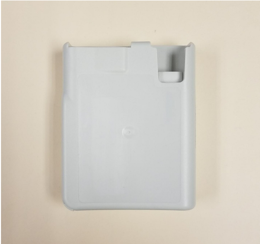
Host Device – Back View

FCC Part 15/ISED Certification 07P-341 0147A-341 17-0338 March 30, 2018 Inventek ISM43340-M4G-L44