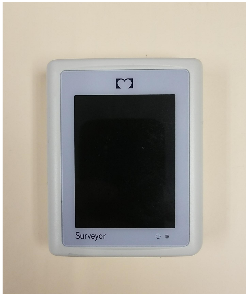
Host Device – Front View

FCC Part 15/ISED Certification 07P-341 0147A-341 17-0338 March 30, 2018 Inventek ISM43340-M4G-L44