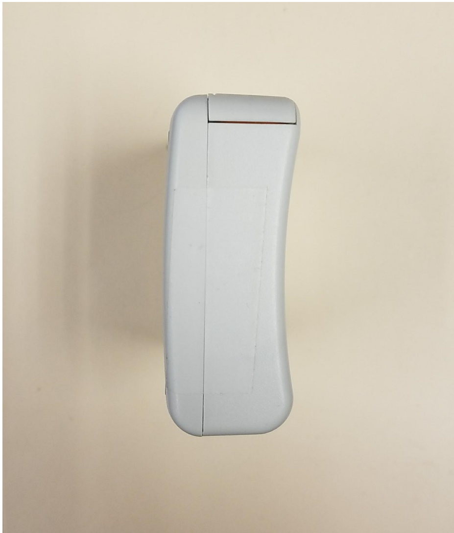
Host Device – Bottom Side

FCC Part 15/ISED Certification 07P-341 0147A-341 17-0338 March 30, 2018 Inventek ISM43340-M4G-L44