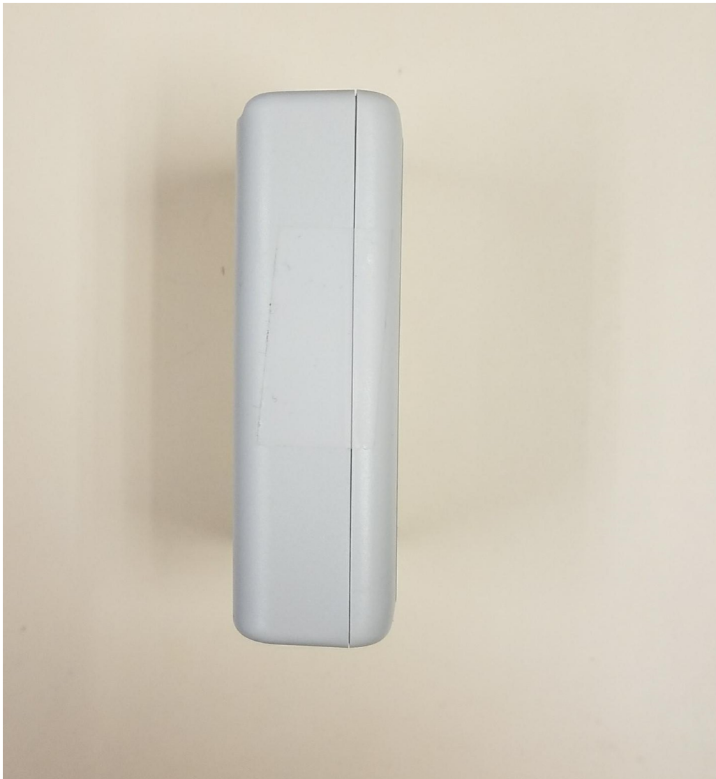
Host Device – Side 2

FCC Part 15/ISED Certification 07P-341 0147A-341 17-0338 March 30, 2018 Inventek ISM43340-M4G-L44