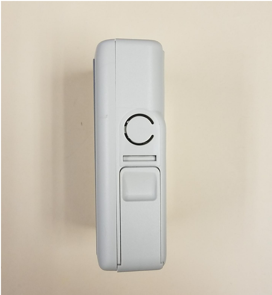
Host Device – Side 1

FCC Part 15/ISED Certification 07P-341 0147A-341 17-0338 March 30, 2018 Inventek ISM43340-M4G-L44