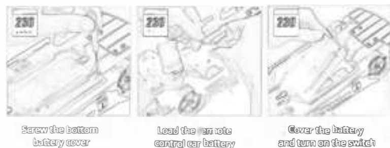
Screw the bottom battery cover