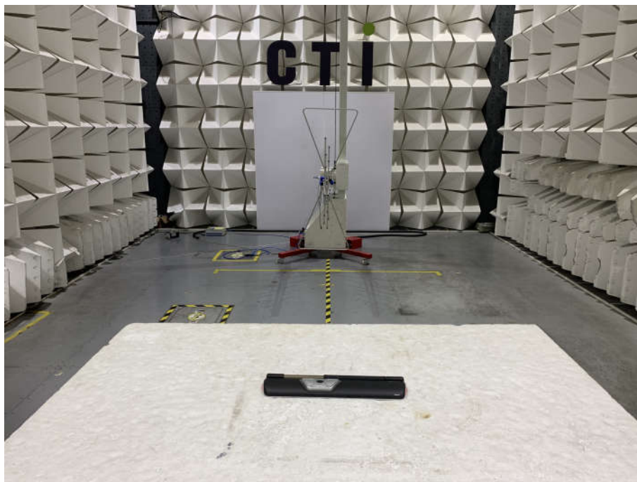
Radiated spurious emission Test Setup-1 (Below 1GHz)