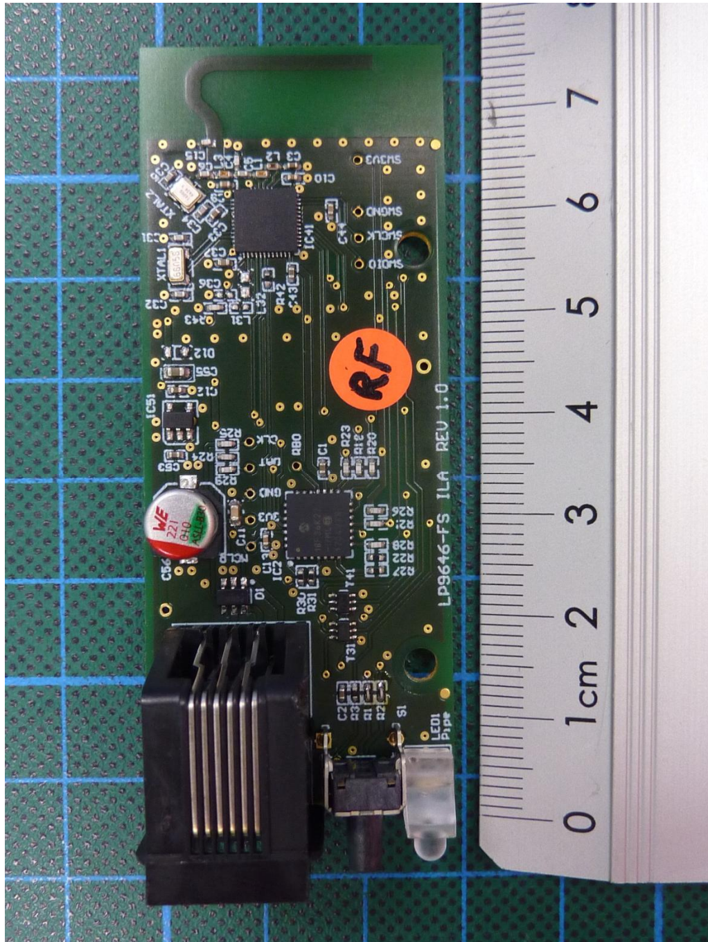
170813_e.JPG: Transceiver PV, PCB, top view