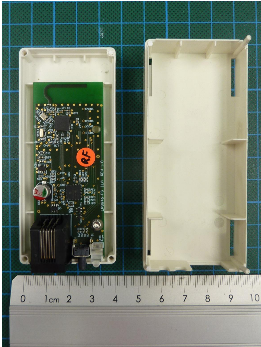
170813_d.JPG: Transceiver PV, internal view