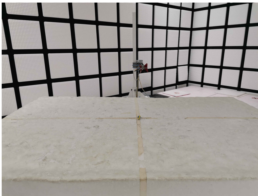
Radiated spurious emission Test Setup-2(Above 1GHz)