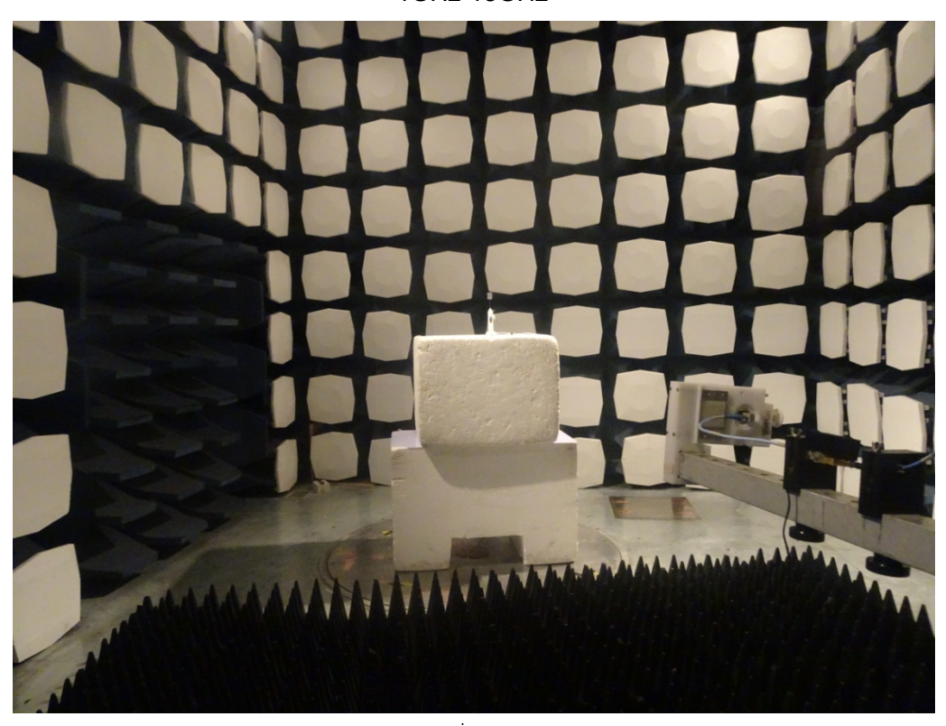
18GHz - 26.5GHz