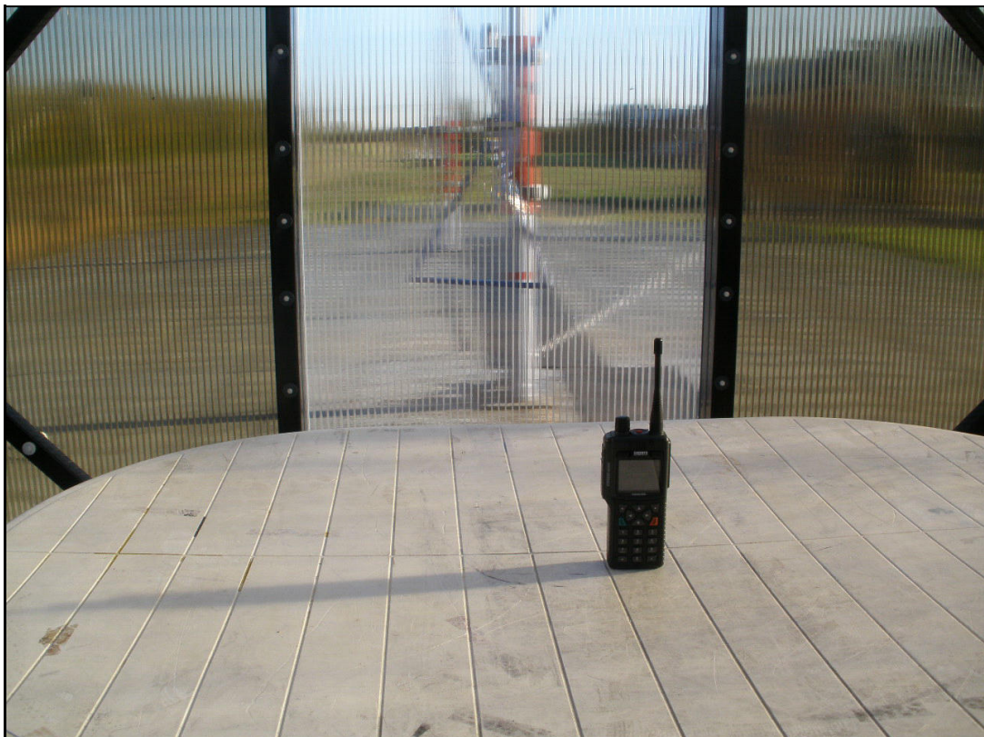
Photograph 2 Radiated Emissions

This report shall not be reproduced except in full, without the written approval of: dB Technology (Cambridge) Ltd.