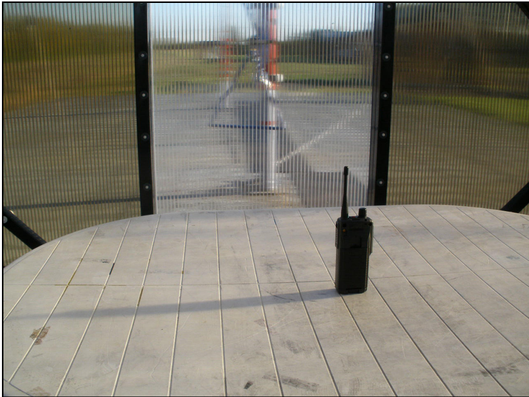
Photograph 1 Radiated Emissions