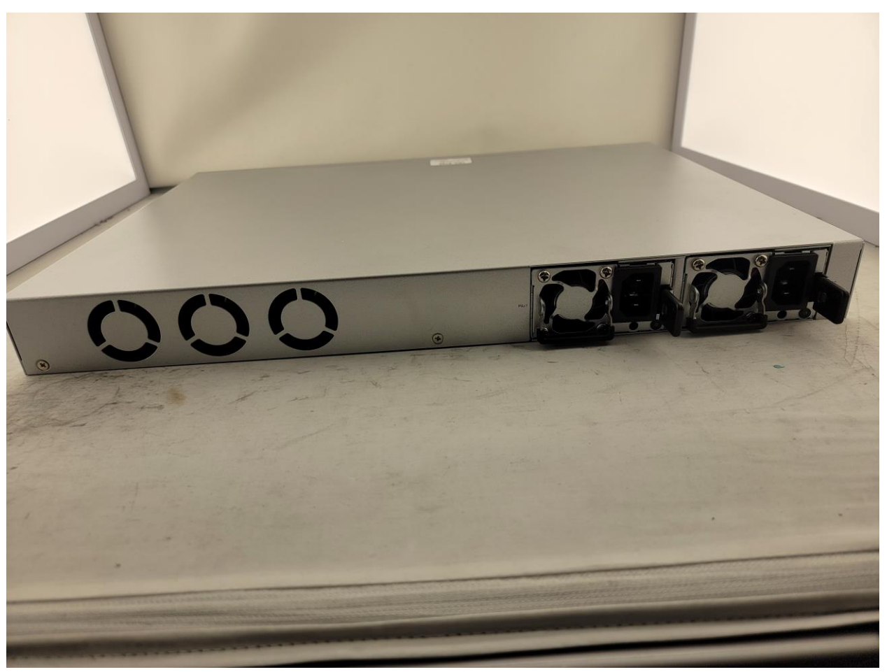
Photograph 3: Back View of DUT