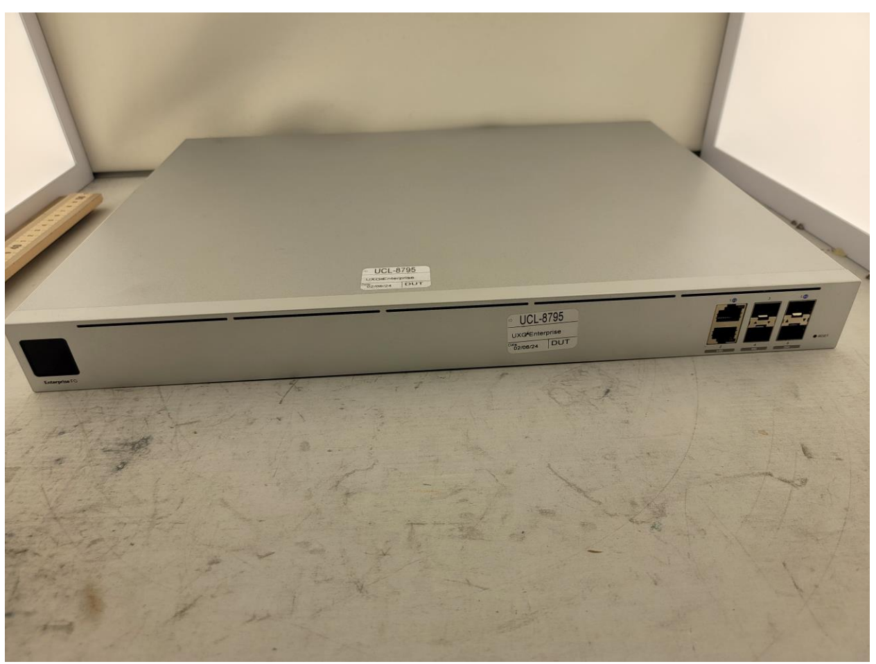
Photograph 1: Front View of DUT