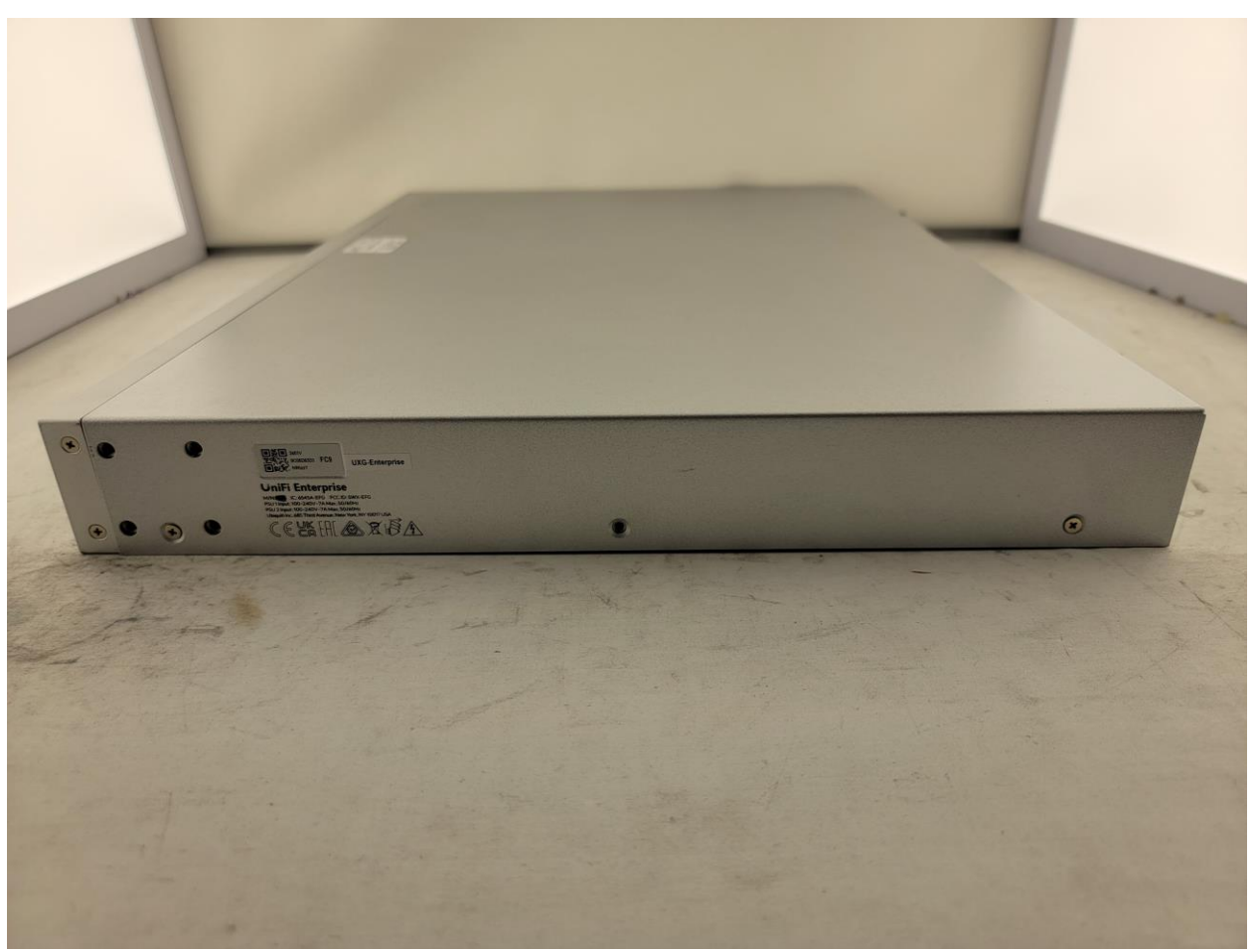
Photograph 4: Right View of DUT