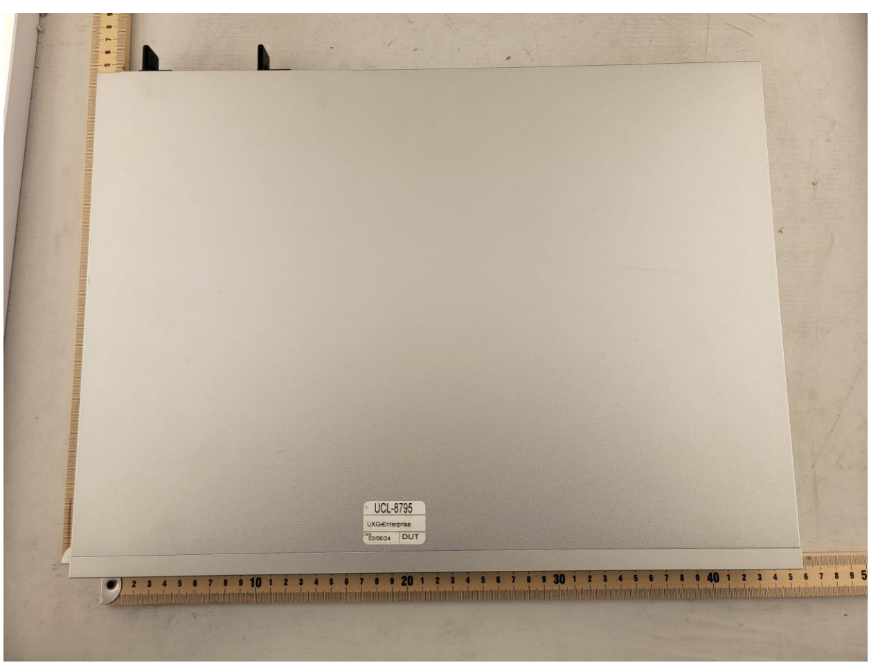
Photograph 6: Top View of DUT