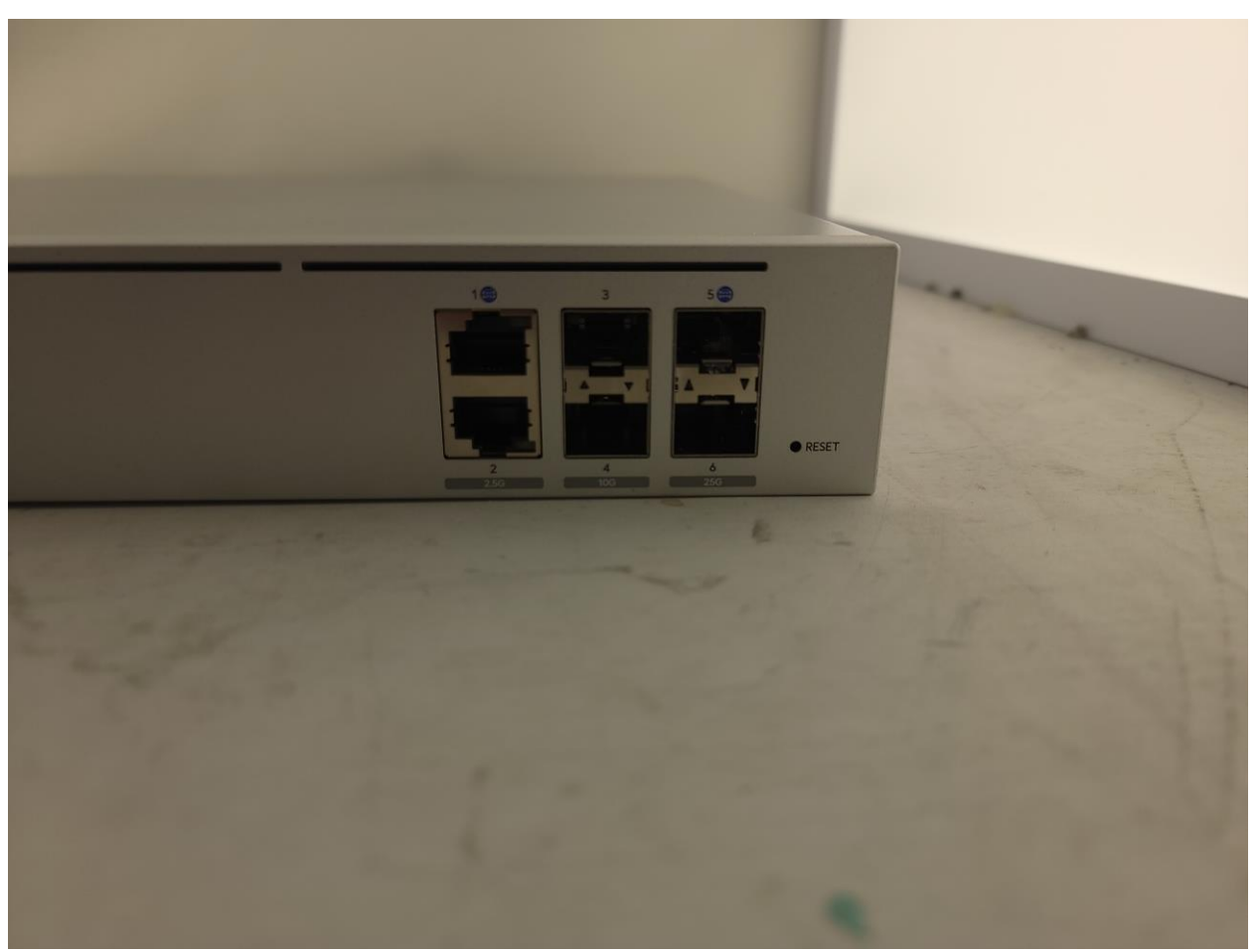
Photograph 2: Front View of DUT Close-up of Ports