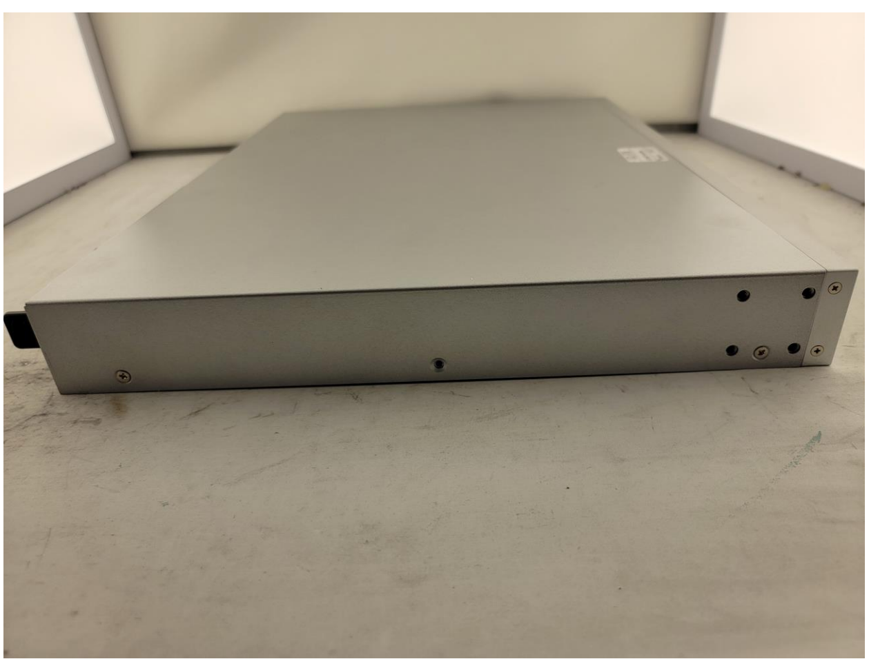
Photograph 5: Left View of DUT