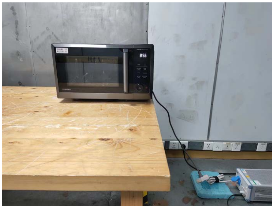
Photo of Power Line Conducted Emission Measurement