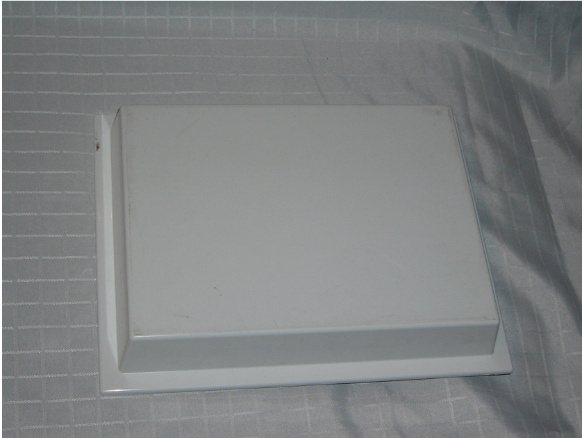
Figure 1 – External, sealed front cover of unit