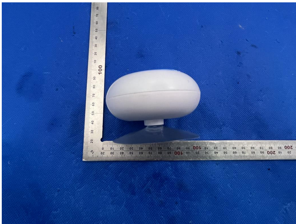
BACK VIEW OF EUT