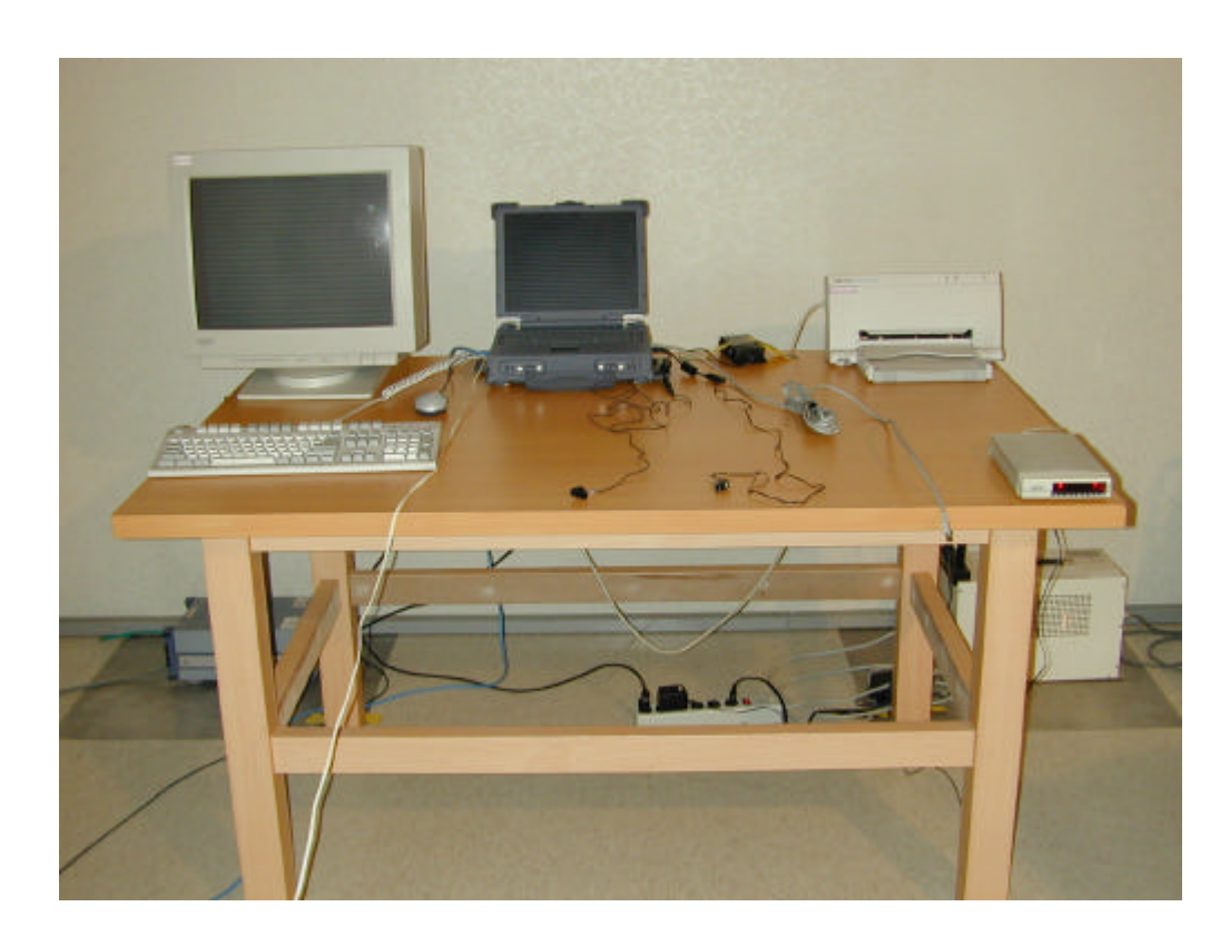
Back View of Conducted Test (Mode 1)