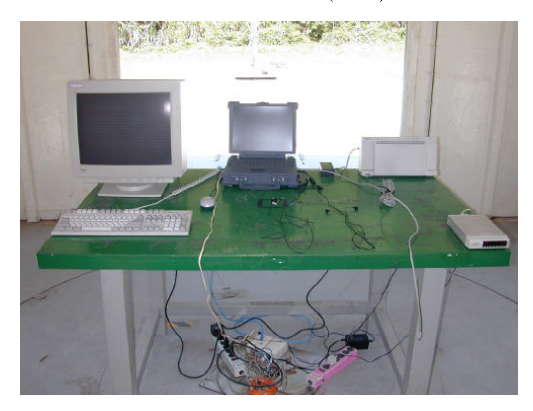
Back View of Radiated Test (Mode 1)