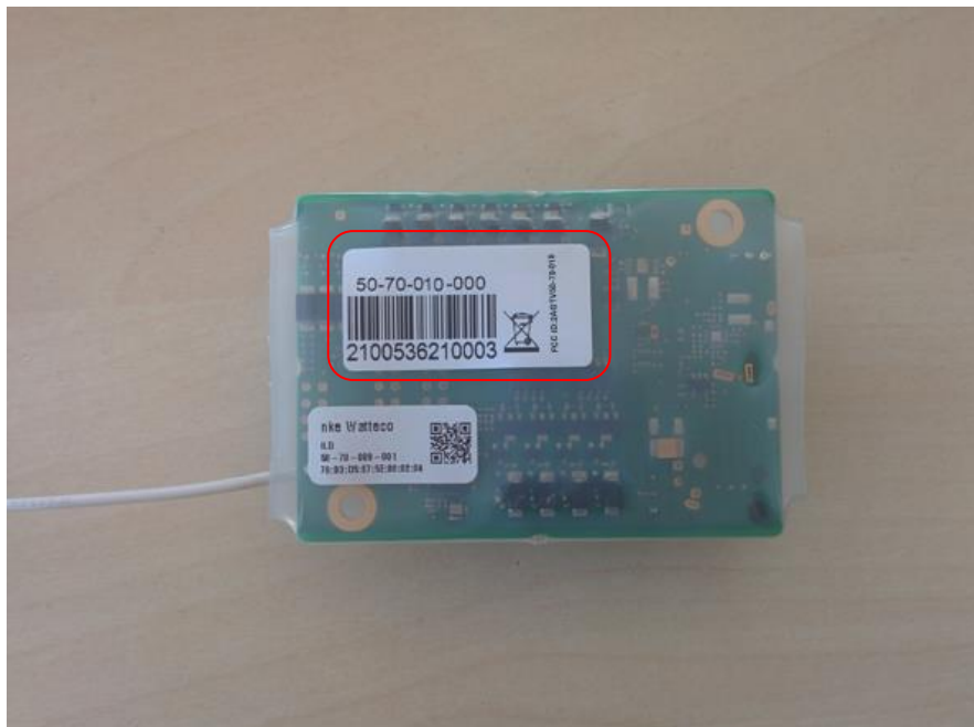
FIGURE 2 - FCC LABEL LOCATION

This label is put behind the device, on the heat shrinkable sheath as it can be seen on the illustration here below. The label is laminated and permanently attached to the sheath.