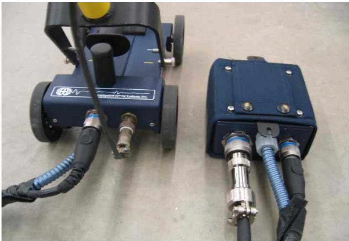
View of connectors