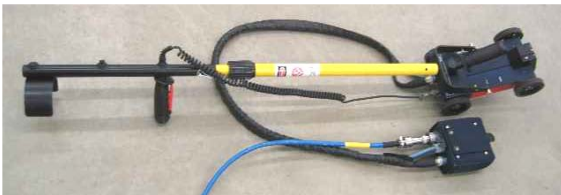
Top View with tow handle and dead man switch