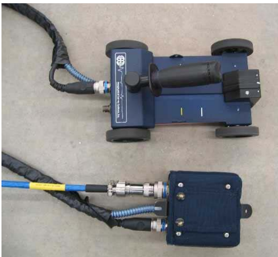
Top view with tow handle removed