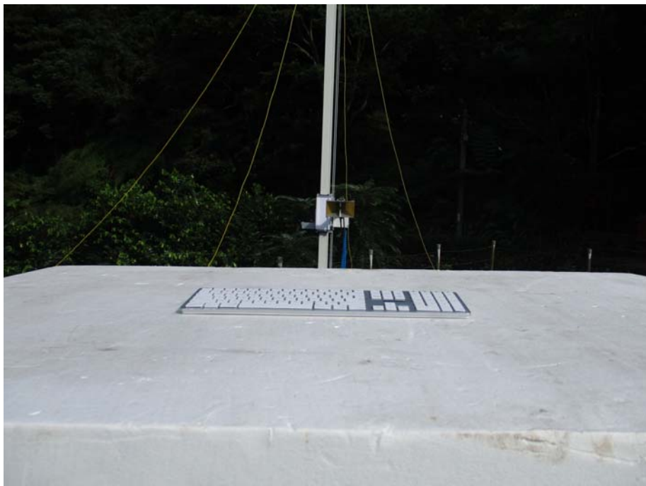
Above 1 GHz