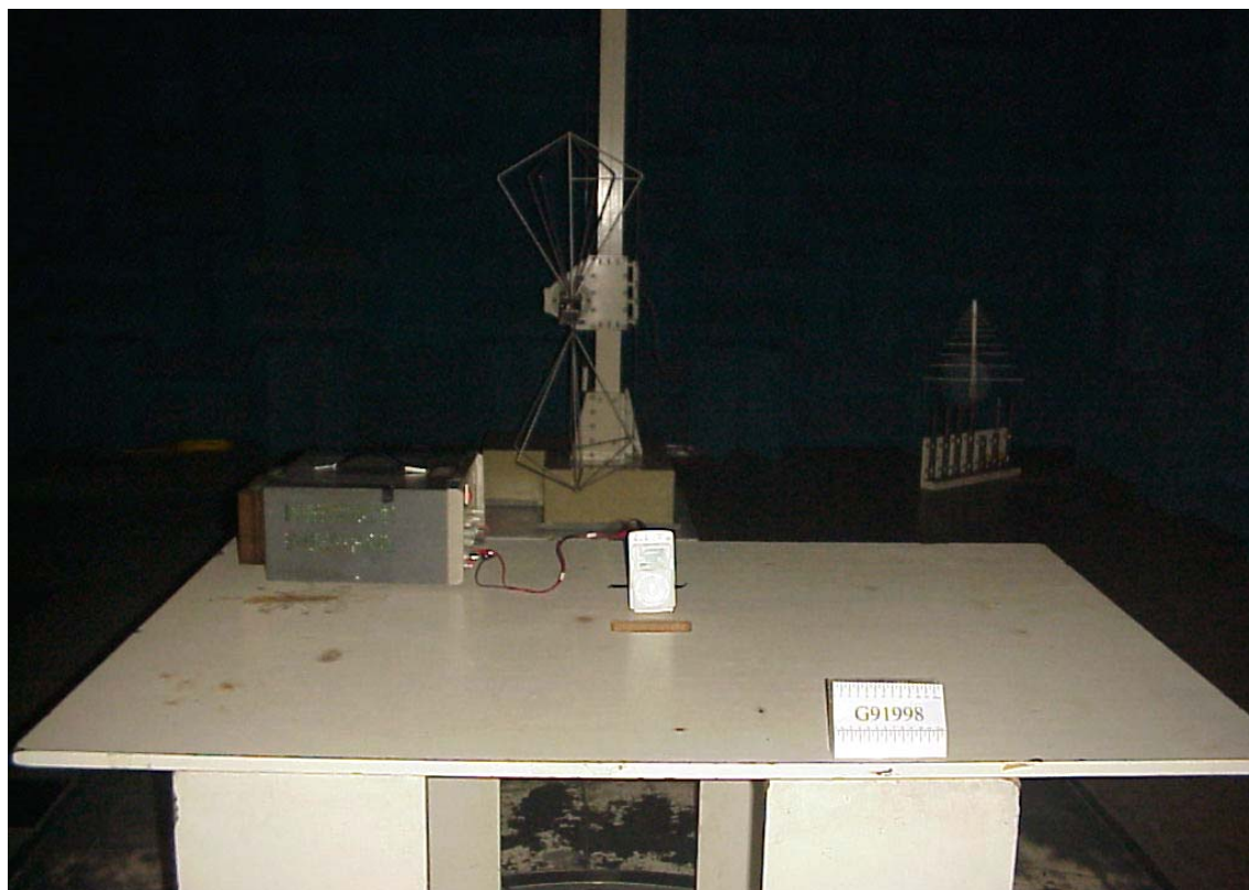
FRONT VIEW OF RADIATED TEST