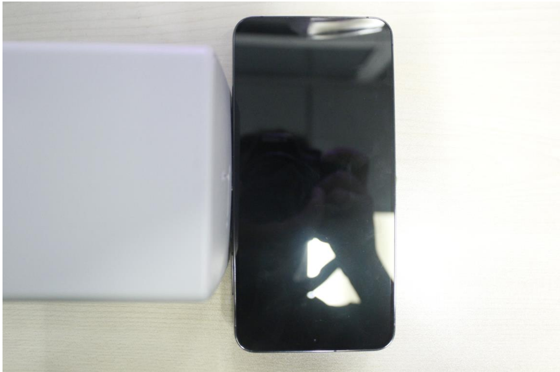
Picture 5 Right side 0cm