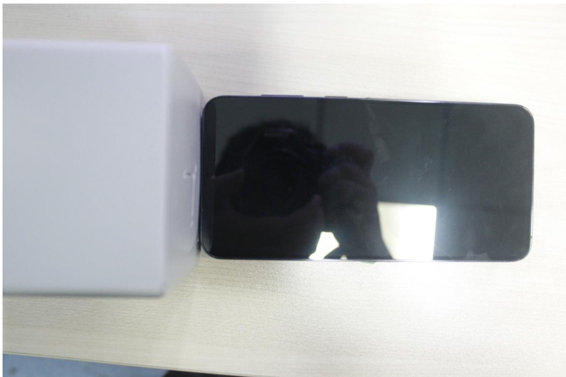
Picture 6 Top side 0cm