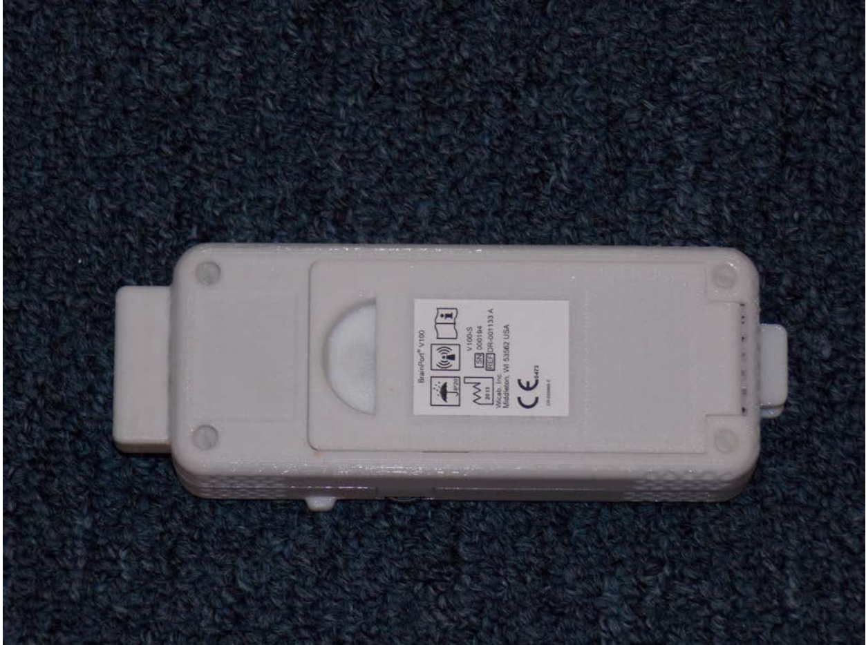
Back of Device