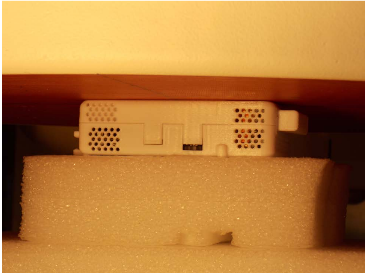
Test Position Side A 0 mm Gap