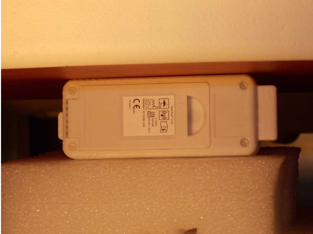
Test Position Side D 0 mm Gap