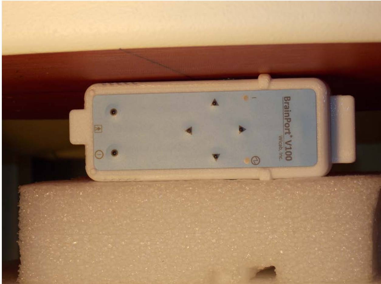
Test Position Side C 0 mm Gap