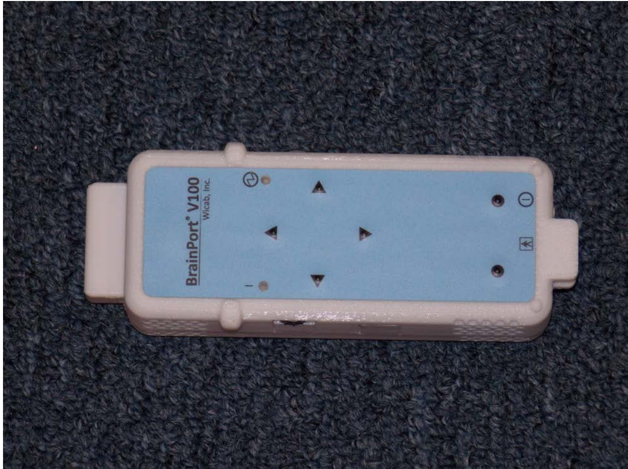
Front of Device