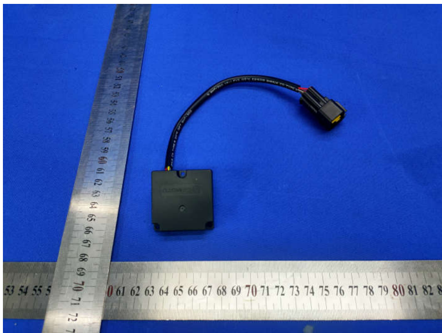
View of Product-1