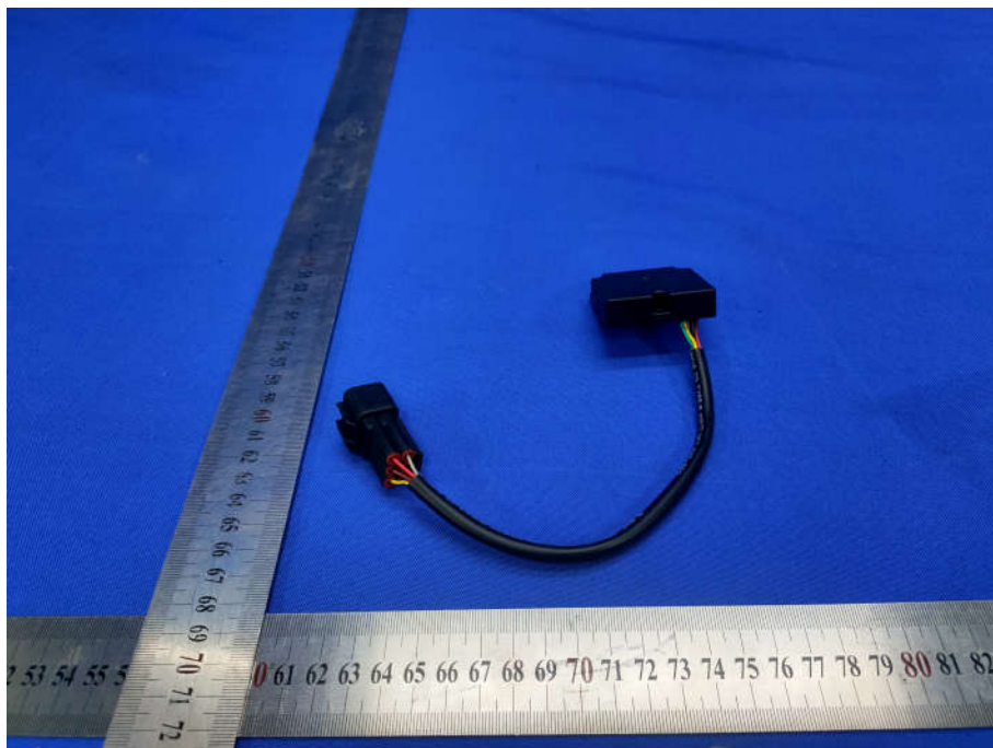
View of Product-5