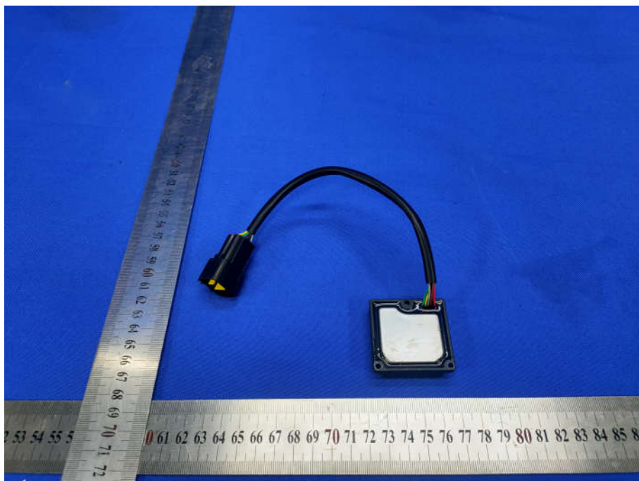
View of Product-6