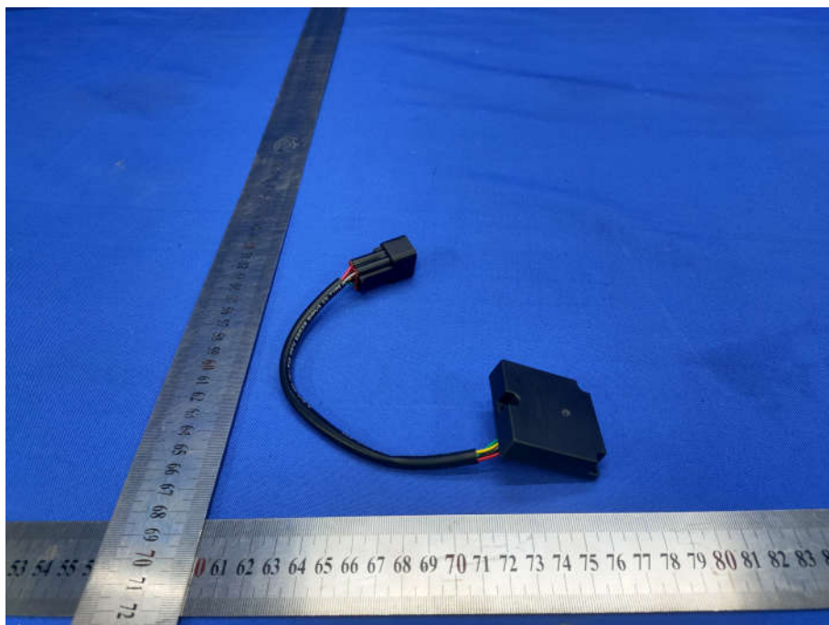
View of Product-4