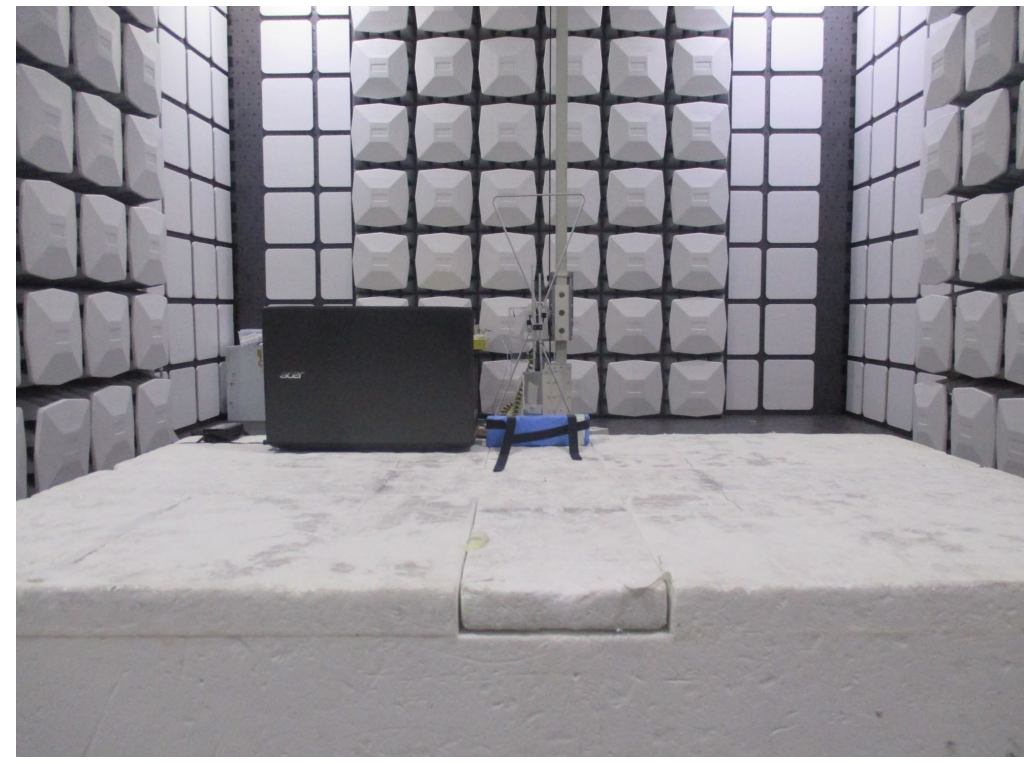
Description: Back View of Radiated Spurious Emission Test Setup (below 1 GHz)

Description: Front View of Radiated Spurious Emission Test Setup (below 1 GHz)