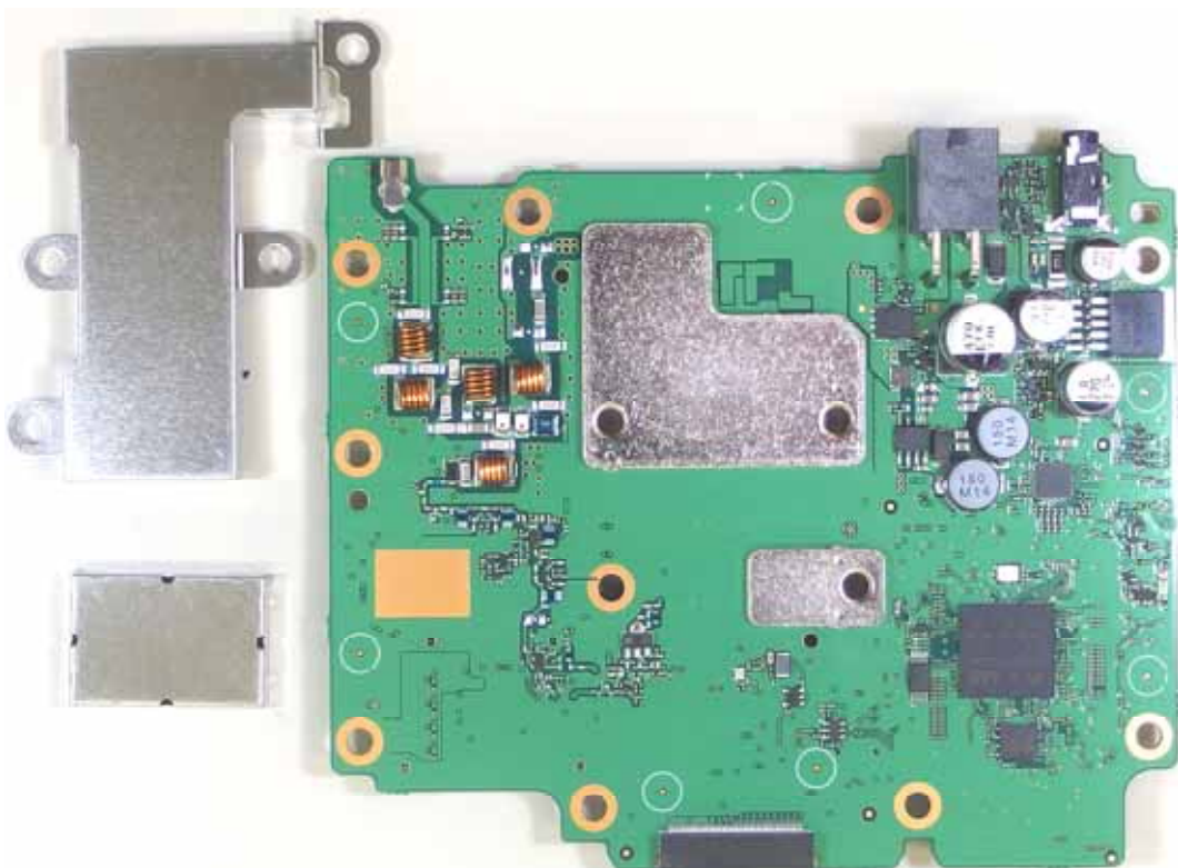
IC-F5130D Main board side-B