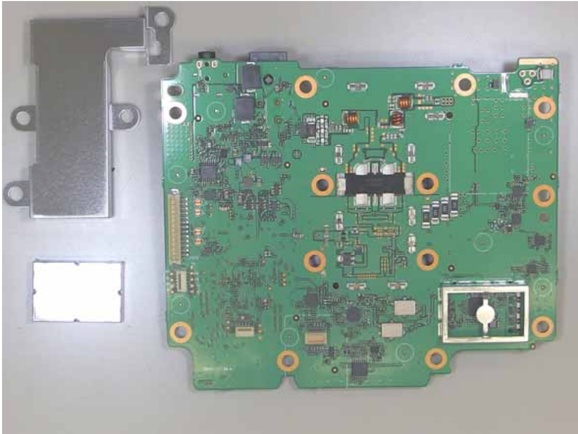
IC-F5130D Main board side-A