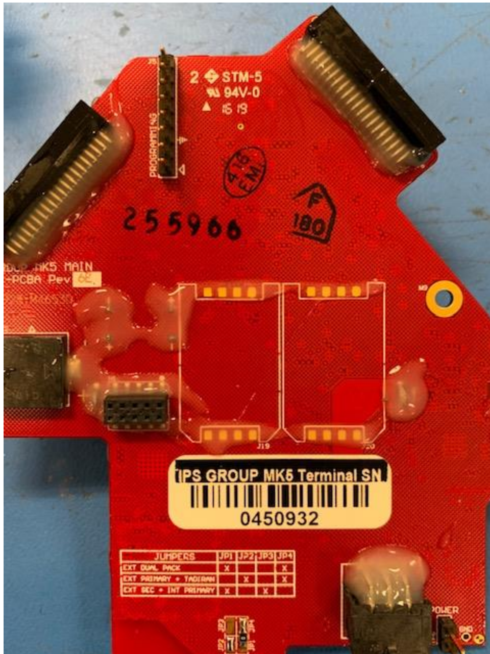
Bottom side of main board