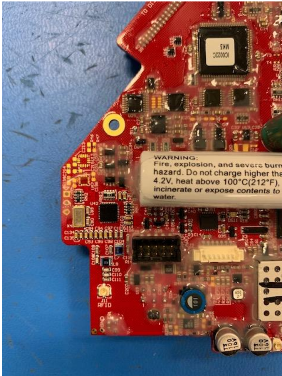
Top side of main board with RFID chip shown on left side of battery