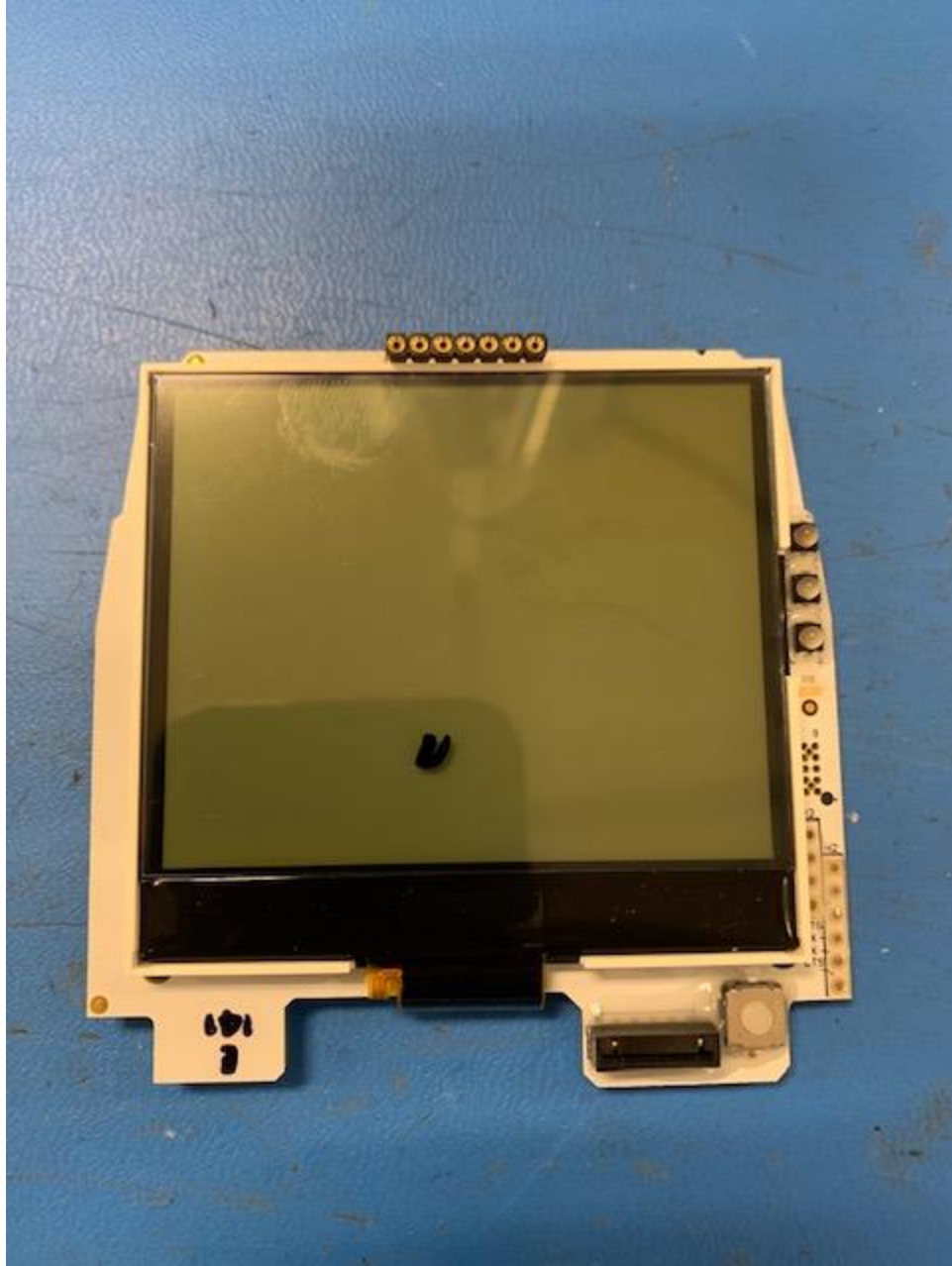
Bottom side of NFC board with LCD display installed