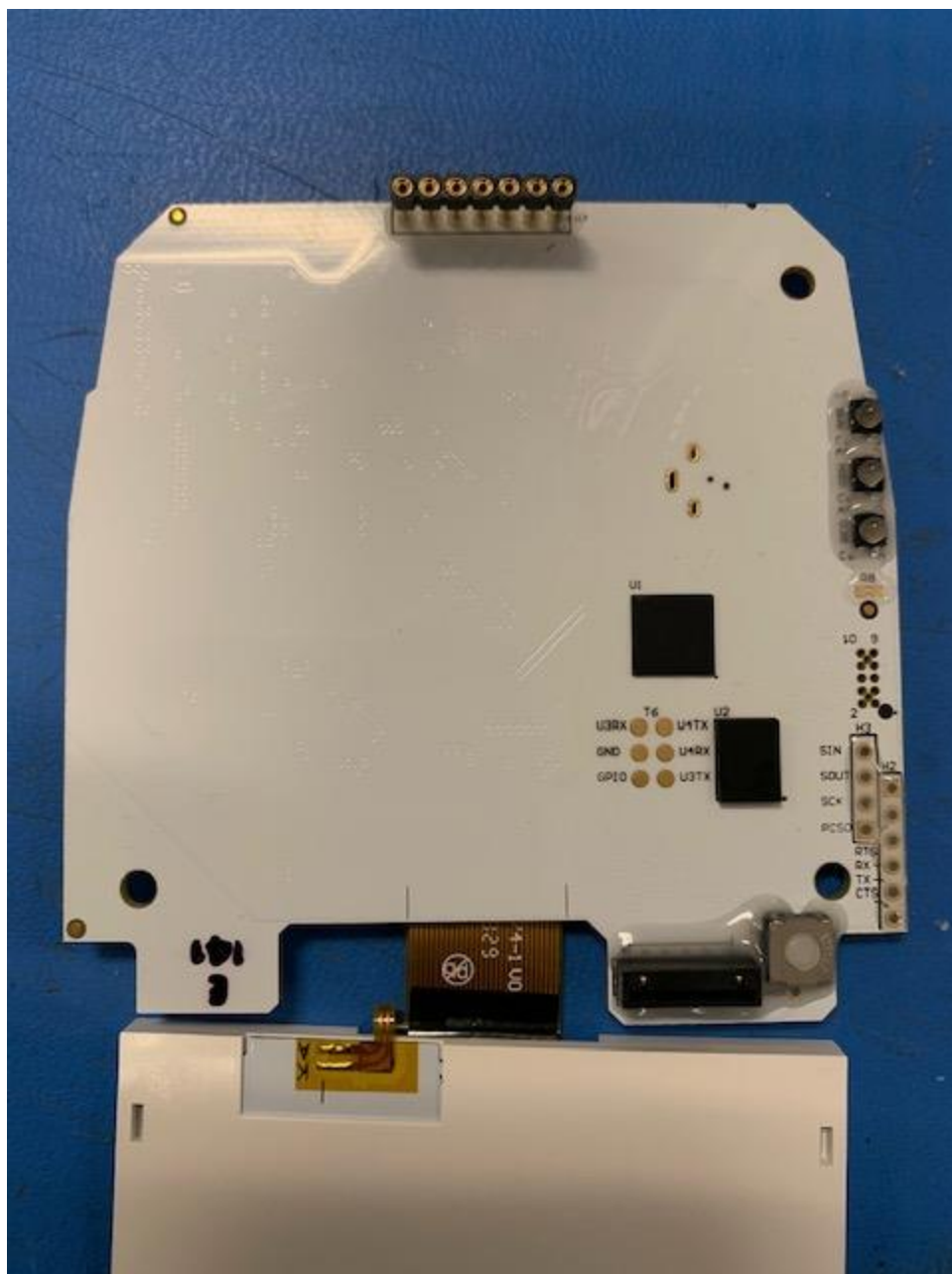
Bottom of NFC circuit board