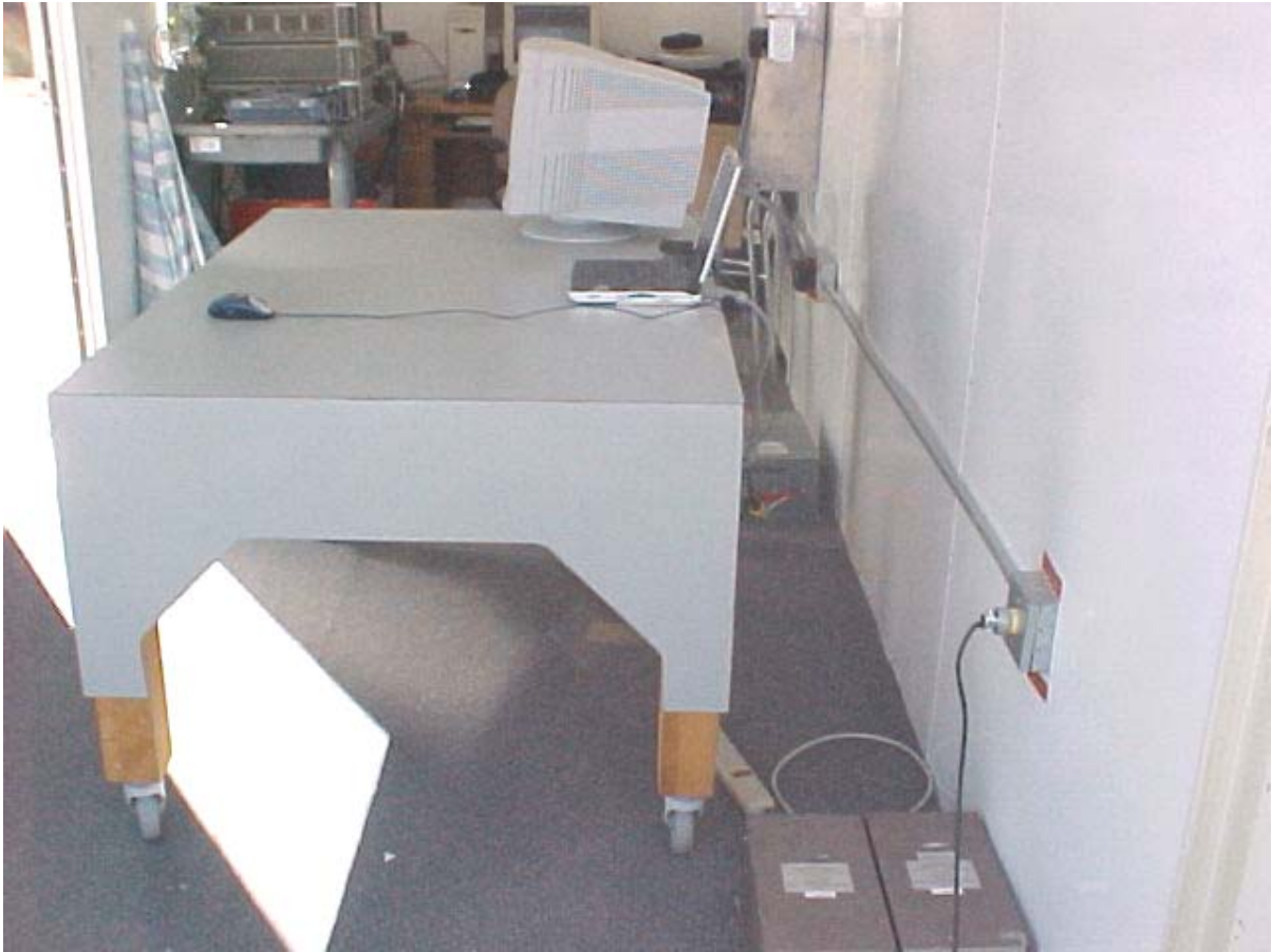
AC Conducted Emissions Measurement (Rear View) Setup