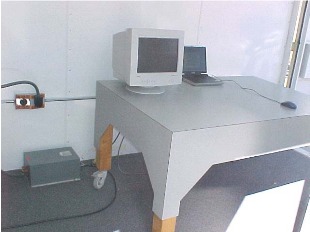
AC Conducted Emissions Measurement (Front View) Setup