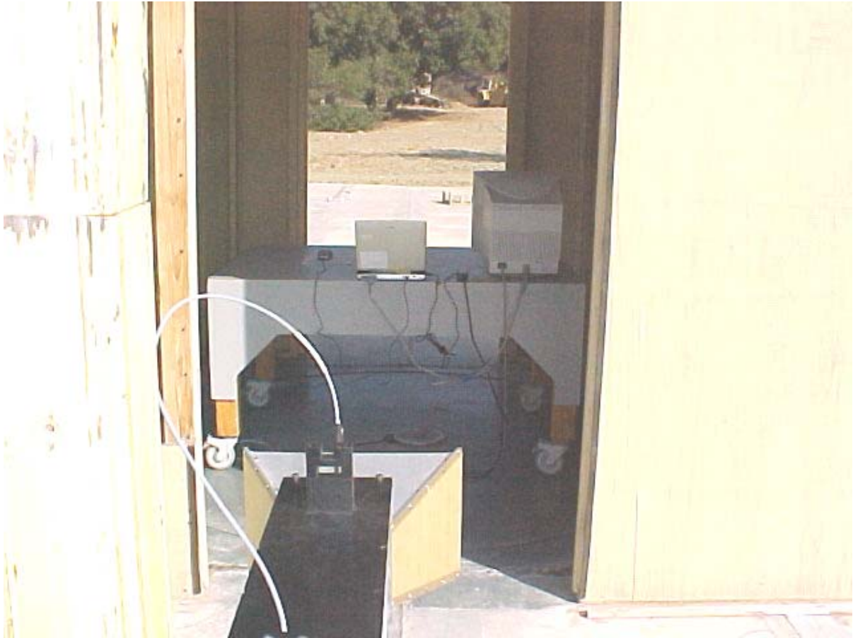
Radiated Emissions Measurement (1-26.5 GHz) (Rear View) Setup