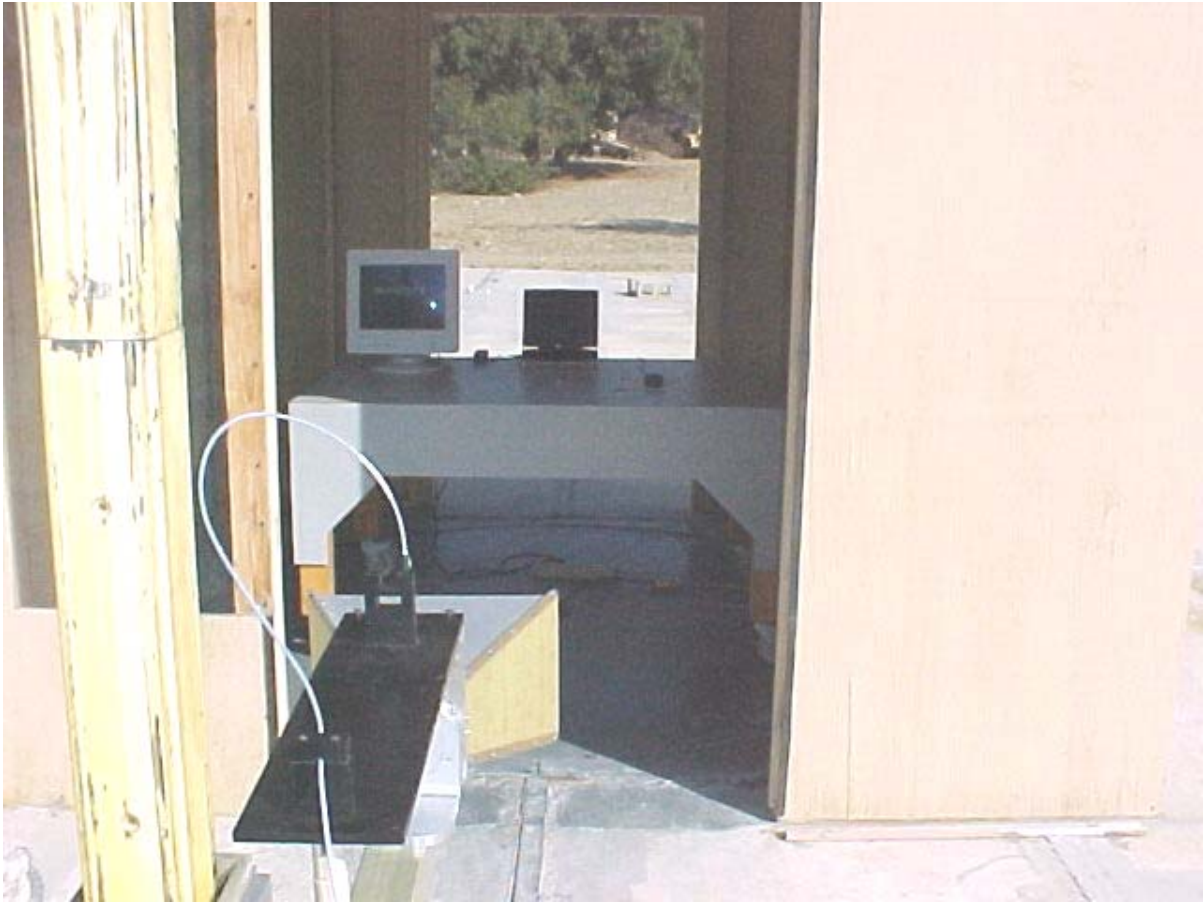
Radiated Emissions Measurement (1-26.5 GHz) (Front View) Setup