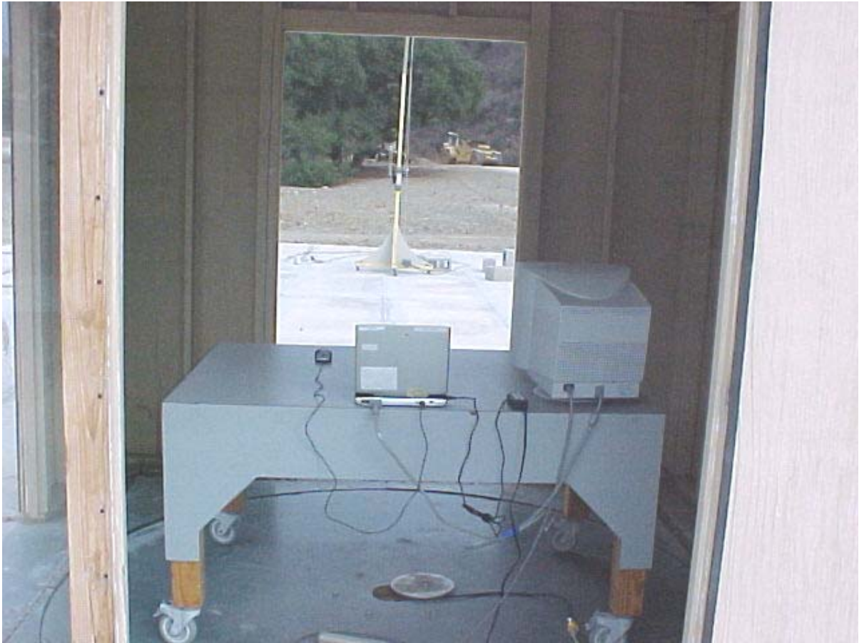
Radiated Emissions Measurement (30-1000 MHz) (Rear View) Setup