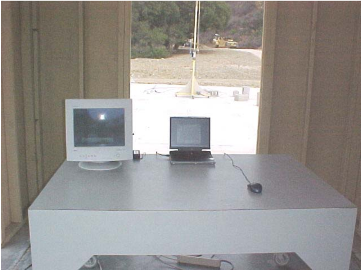
Radiated Emissions Measurement (30-1000 MHz) (Front View) Setup