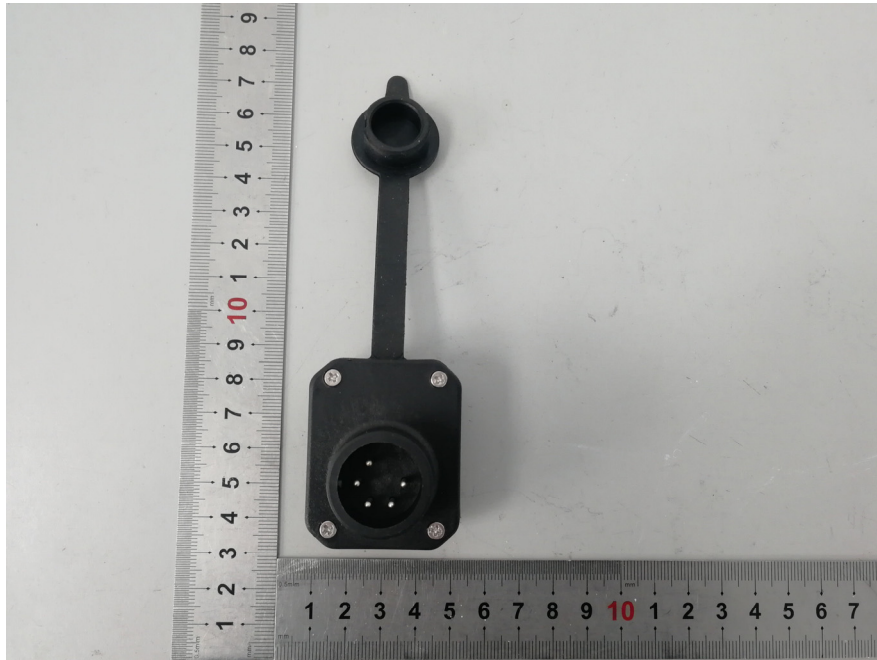
EUT – Cover off View-2