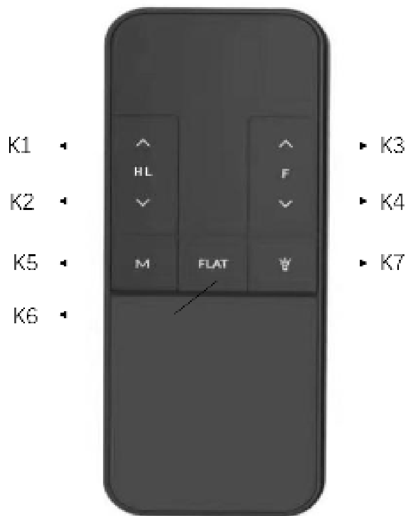
Hand controller 1