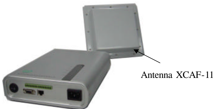
Figure 2-4 Connexion between XCRF-500 reader series and antenna (Sketch map)