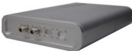
Figure 2-1(b) Appearance of XCRF-500 reader series (right back)