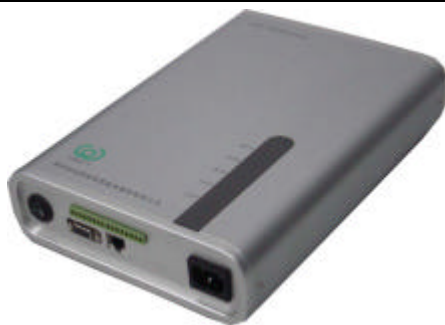
Figure 2-1(a) Appearance of XCRF-500 reader series (front right)