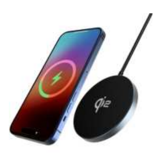
1 Magnetic wireless charging area fbr iPhone 2 Power supply: TYPE-C.