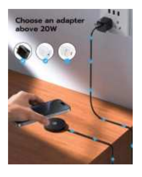
Please use a 20W or higher power wall charger to connect the Wireless charger