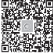
Android OR Code Download

First scan the QR code or the APP store to download the app