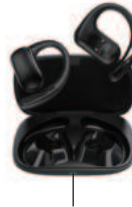
Charging bay light display