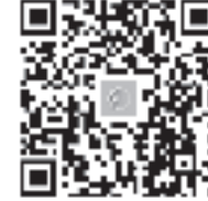
IOS Code Download

Before using the translation headset, please follow these steps: Scan the QR code of the manual/packaging box to download and install. In all major mobile APP store, search for "one-click" app. Make sure your headphones are fully charged.