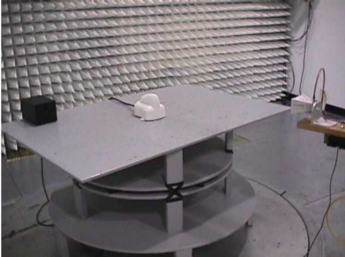
Radiated Emissions Test Configuration